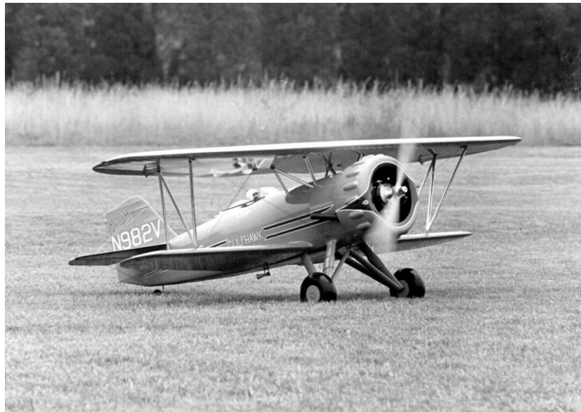
Taxiing the model at the NVRC field near Dulles Airport, VA.