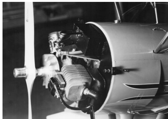
1.9 cubic inch chainsaw engine – the metal tank above the engine was used to hold diesel fuel for the smoke system.

Crank case pressure was tapped off the engine to pressurize the tank. Diesel fuel was injected into the exhaust muffler using a separate servo to operate a homemade metering valve.