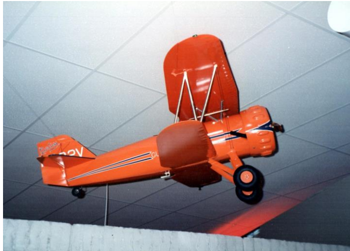
Kirby's Gulfhawk in the AMA's National Model Aviation Museum in Muncie, IN.

photo. This photo along with many others appeared in an article titled “Project Snapshot” by Luther in the June 1979 issue of Model Aviation magazine.