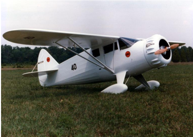
1978: Finished model at the NVRC Field in Arcola, VA.

The model was covered with Permagloss Coverite and painted with hardware store polyurethane. The windshield was made from Lexan. The wingspan is nine feet and final weight is 20 lbs. A 20" x 5" Kolbo propeller was used.