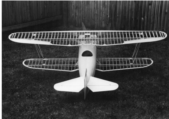
Ready for covering - the top wing spanned 84" and the bottom was 69".

The wings presented quite a challenge because they were tapered in both cord and thickness. There were 51 ribs in the top wing and 38 in the bottom. Each rib was a different size, starting from the center out to the tip. A drawing had to be made up for each rib size. It took me 4 months to draw up the plans and 6 months to build the model.