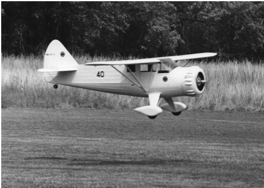
John was very active in scale modeling and in photography.