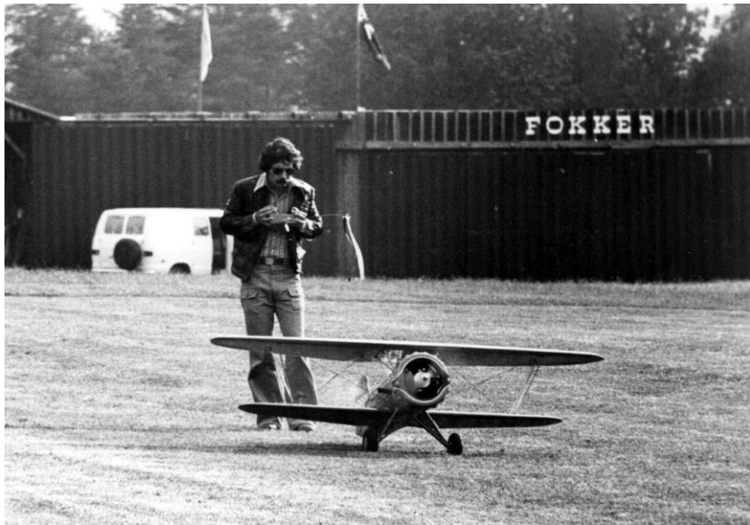
1978: Me with the Gulfhawk, ready to take off at the DCRC “Monster Scale” Contest in Virginia.