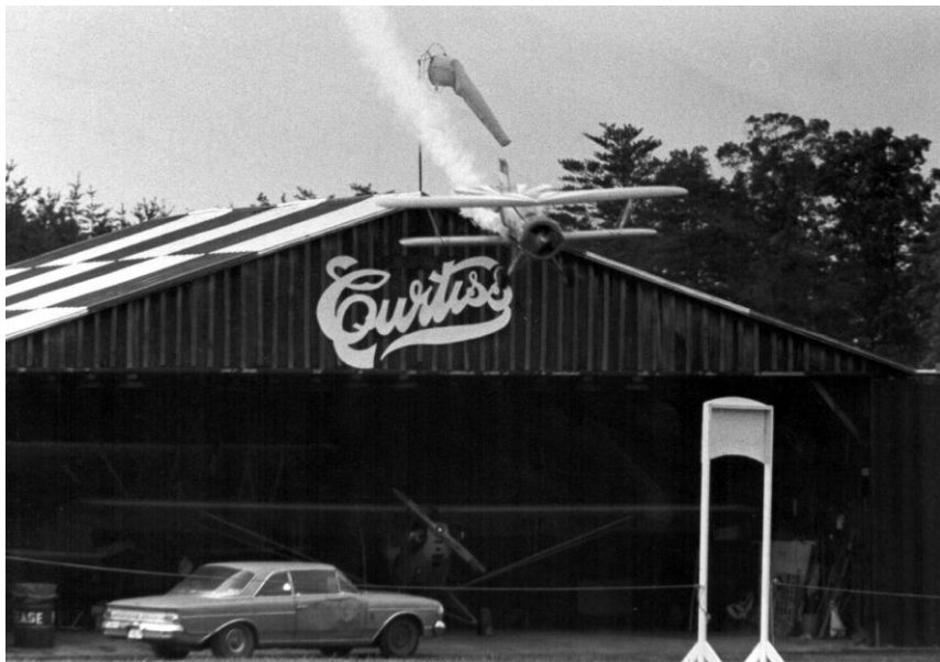
1978: Diving for speed for a fast flyby, with air show smoke for the judges, at the Bealeton, VA Monster Scale Contest.