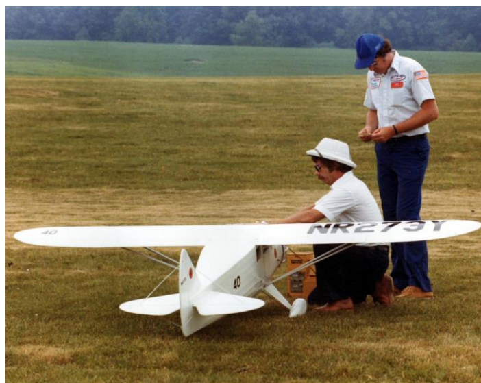
September 1977: Getting ready to fly at Bealeton, VA.

The Mister Mulligan was one of the earliest "Quarter Scale" models using a gasoline engine to be built and flown in the eastern part of the United States before the quarter scale movement became popular. Many demonstration flights were flown in Northern Virginia, Maryland, and the Washington D.C. area in the late 1970s. It flew in one of the early annual all scale events and full-scale air show at Bealeton, VA in September 1977. It was invited to fly at many full-scale air shows including Maryland Air Park, Golden Wings over Richmond, VA, and in front of the crowds at Armed Forces Day at Andrews Air Force Base in May of 1979. Despite its large size, it was an excellent aerobatic performer.