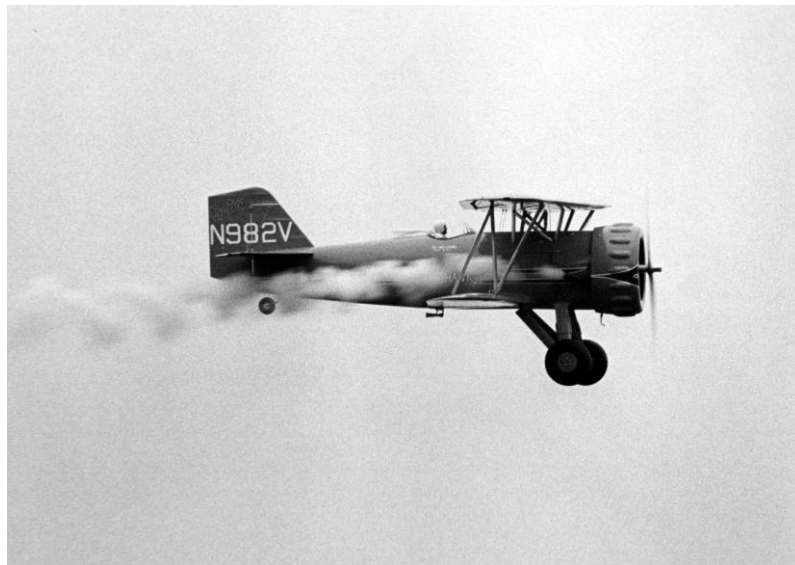
A flyby with air show smoke.

In September of 1978 the District of Columbia Radio Control Club (DCRC) held one of its earliest “Monster Scale” contests at the Flying Circus field near Bealeton, Virginia. I entered the Gulfhawk and competed in scale judging and flying. Some notable RC pilots competed, including Walt Moucha and others. The Gulfhawk took first place and Walt came in second.