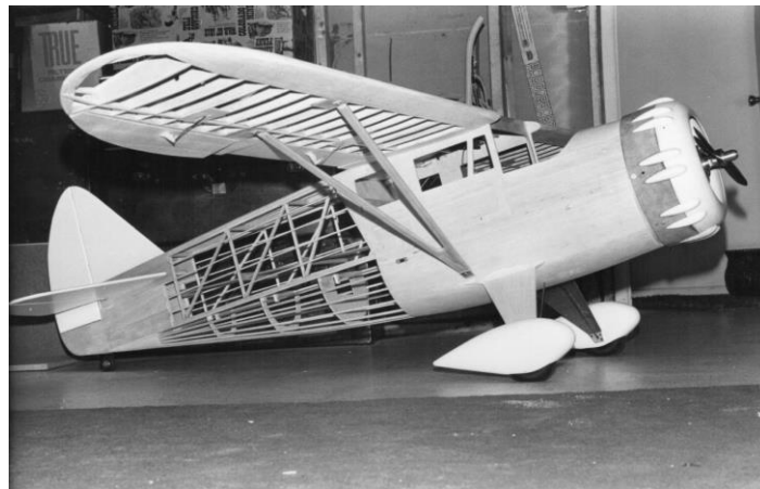
Ready for final covering.