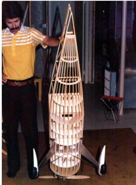
1976: Framed up Mister Mulligan fuselage with pine longerons and a ¼” plywood firewall in my basement shop, Chantilly, VA.

The original Nosen kit was designed using very light materials, mostly balsa and light plywood. To handle the larger engine, I used ¼” pine longerons and a ¼” plywood firewall. Five Kraft servos were used to operate throttle, ailerons, flaps, rudder, and elevator. The model was flown with a Kraft Series Seventy-Seven (1977) radio.