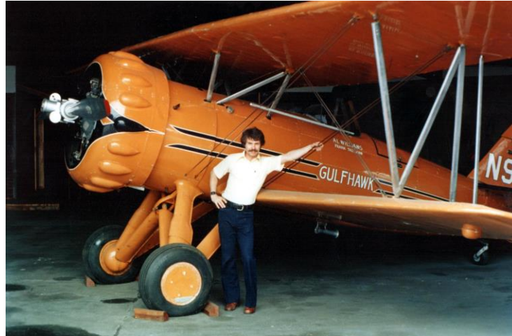
1977: Me at the Marine Air Museum in Quantico, VA.