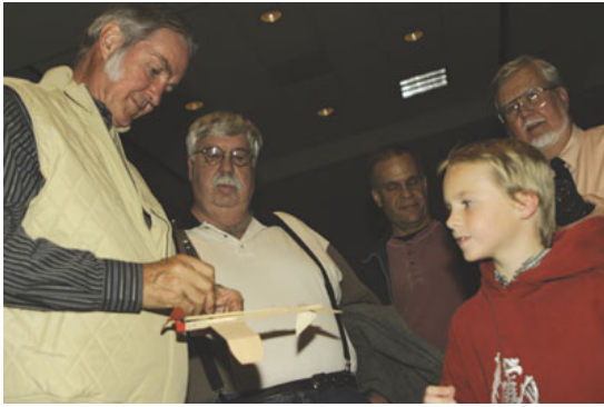
Guests at the Model Aviation Hall of Fame banquet were thrilled with Burt Rutan's presence. Many young and old in attendance captured a gladly personalized memento.