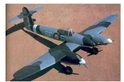
Westland Whirlwind British