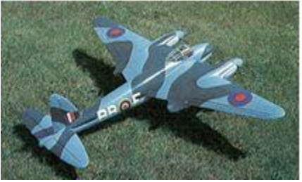
DH 98 Mosquito British