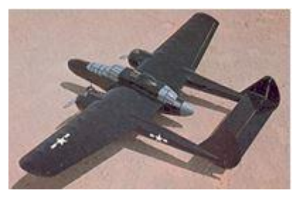
P-61 Black Widow