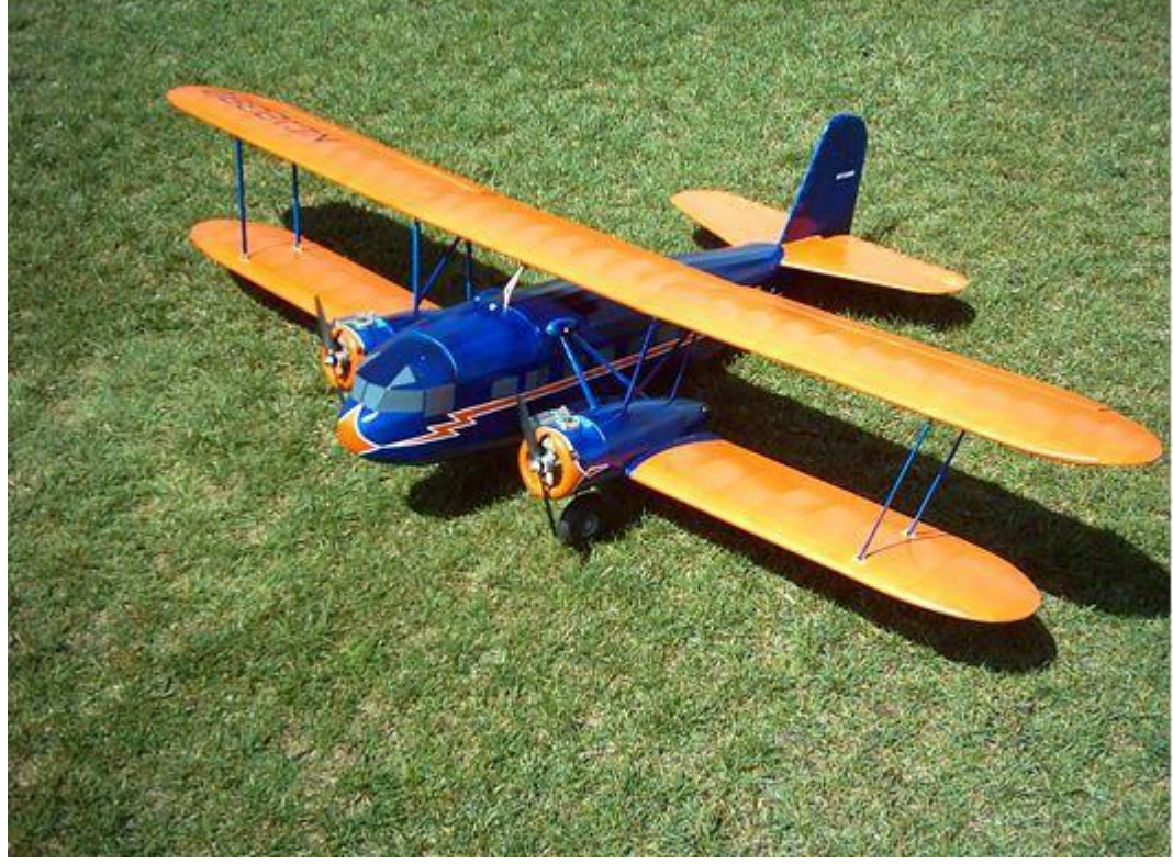
Curtiss Condor, 60" WS, Magnum .15 engines