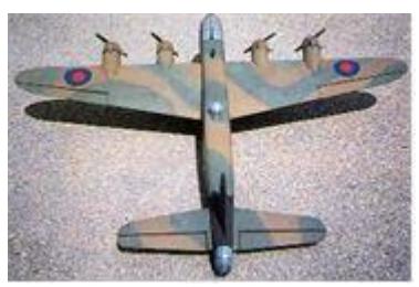
Short Sterling British