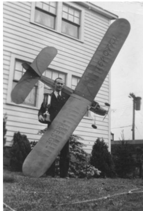
One of Victor's models, which won the 1940 Bamberger's Silver Cup for endurance flight.