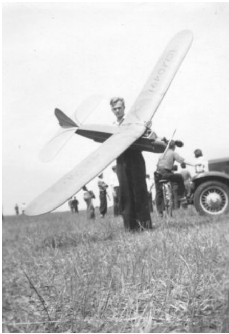
Victor at a model contest at Hodley Field.