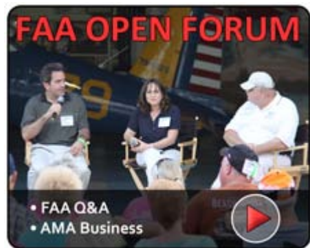
FAA Fields Members' Questions