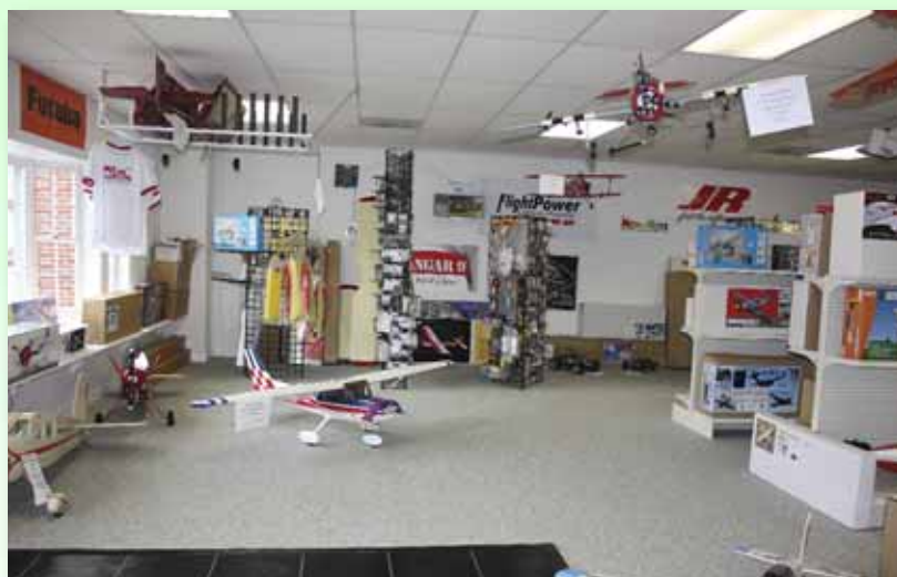
Look inside East R/C and you will find many great RC products manufactured on the premises. Located minutes from the RDRC field, this company is one of many FFT sponsors.