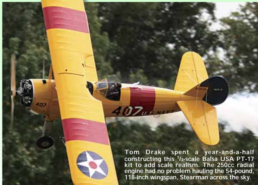
Tom Drake spent a year-and-a-half constructing this 1/3-scale Balsa USA PT-17 kit to add scale realism. The 250cc radial engine had no problem hauling the 54-pound, 118-inch wingspan, Stearman across the sky.

I have a bold—but honest—statement to make: FFT is like no other event I have