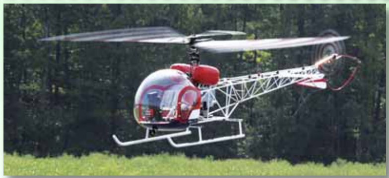
Wayne Parrish piloted this beautiful Vario Bell 47G III. Many scale details combined with its large size made it easy to believe we were watching a full-scale version fly.

Flying for a cause with lots of fun thrown in