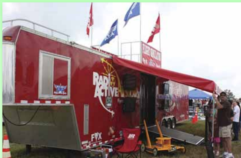
Radio Active Airshows brought its amazing simulator trailer that allowed attendees to fly FS One on two large projection screens.