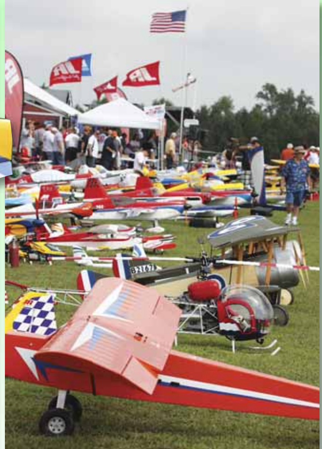
A look down the flightline shows the diversity of models flown at the 2009 FFT event. A total of $27,100 was raised for Victory Junction.