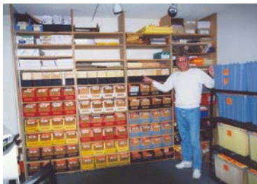
A portion of the Foto-Paaks that Bob has in stock