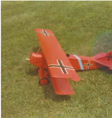
Bob's Sterling Fokker