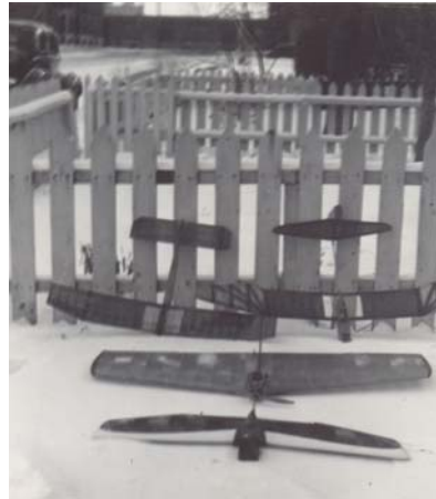
From back left: Fuber 36, Thermic 50X and Half Fast, Sport Wing