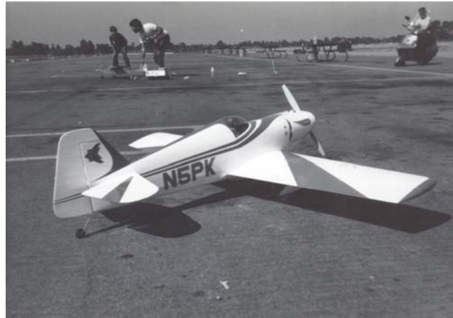
Bob's Kraft Super Fli