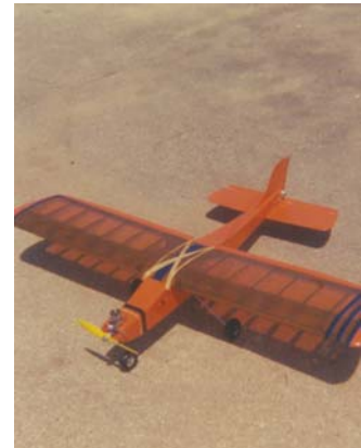
Bob's TopFlite .15 Trainer