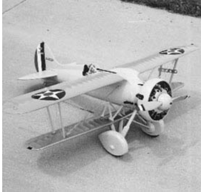
Berliner Joyce XFJ-2 . It has a 49" wingspan and an O.S. 46 engine. It won High Static and first place in Control Line Designer Scale at 2004 Nationals and was featured in a construction article in Flying Models magazine.