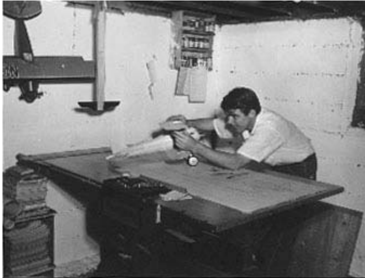
At work on a Curtiss R-6 Control Line scale, circa late 1950s.