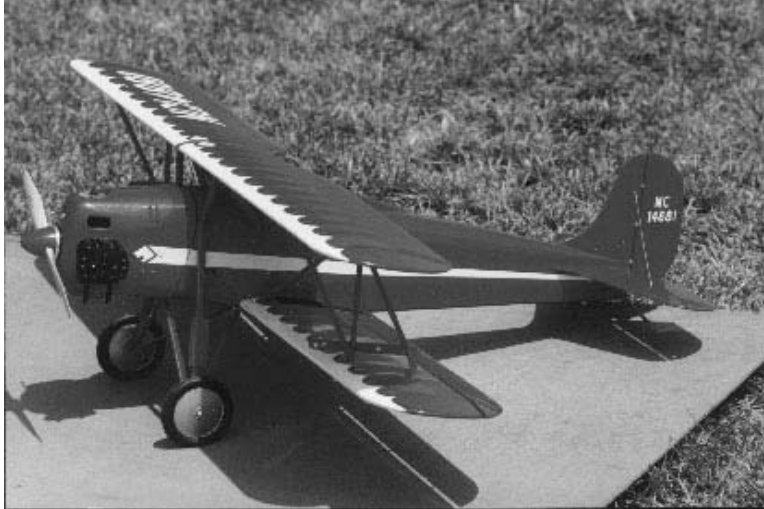
Rose Parakeet. After a twenty year absence from the hobby, this was my re-entry back into designing and building Control Line models.