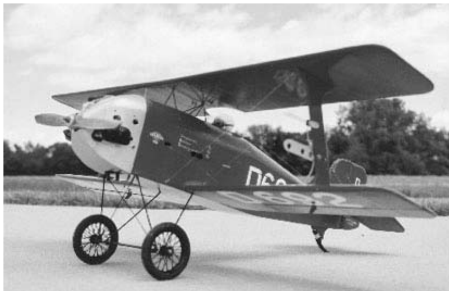
Staaken Z-1 Filtzer . It has a 40 ½ wingspan and O.S. 40 engine. It placed 8 th at the FAI Team Trials at the 005 Nationals.