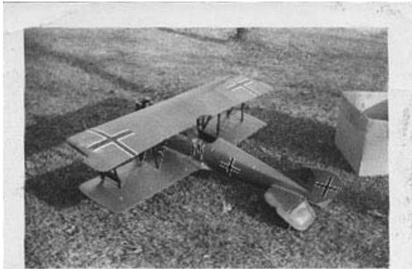
Pfalz D-12 . My first Control Line flying scale model, designed and built in 1947.