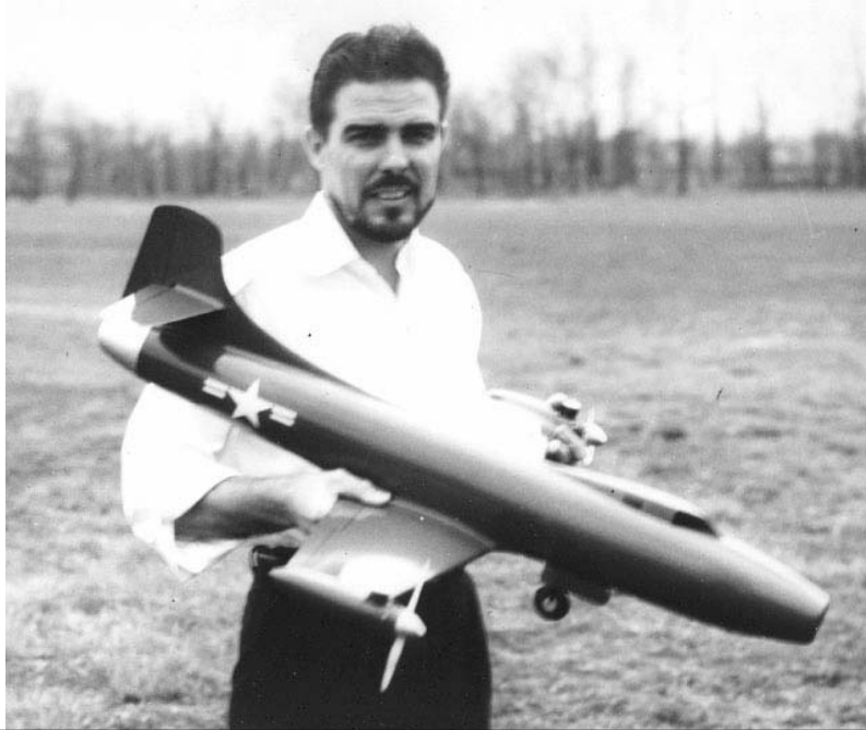
Douglas Skystreak – My beard was grown in 1961 for the East St. Louis Centennial Celebration. It was an interesting experiment and yes, the model did fly.