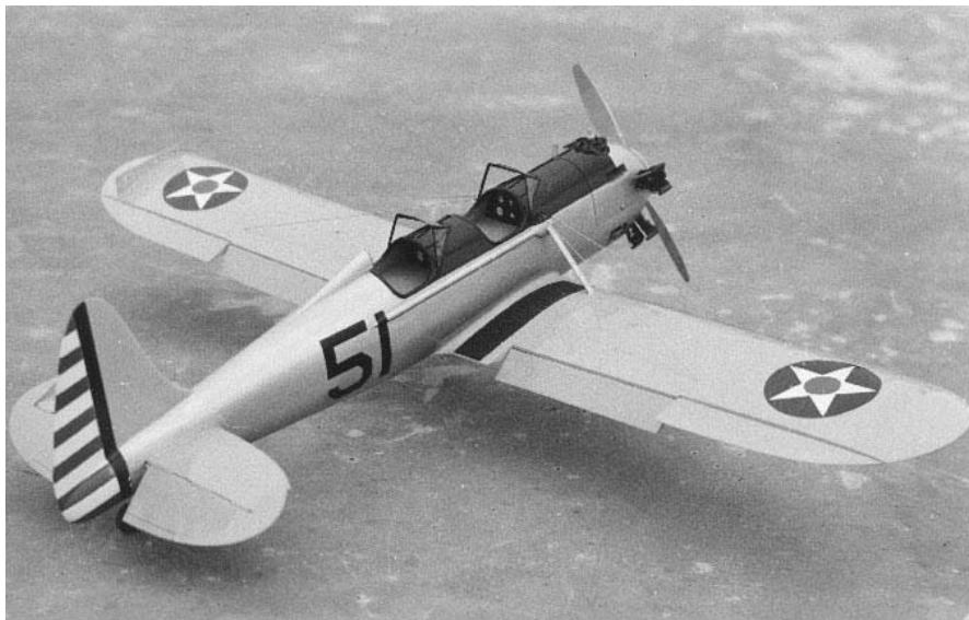
Ryan PT-21 - This featured a Roberts-operated homemade throttle control and flaps which were rarely seen in 1956. The model flew great, handled beautifully on the ground and won three dozen or so trophies.