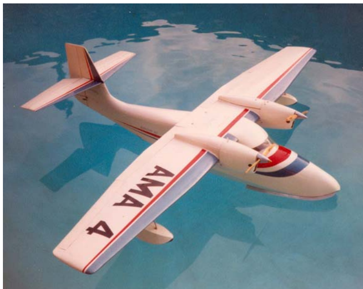
Irwin's Widgeon RC model in January 1986.