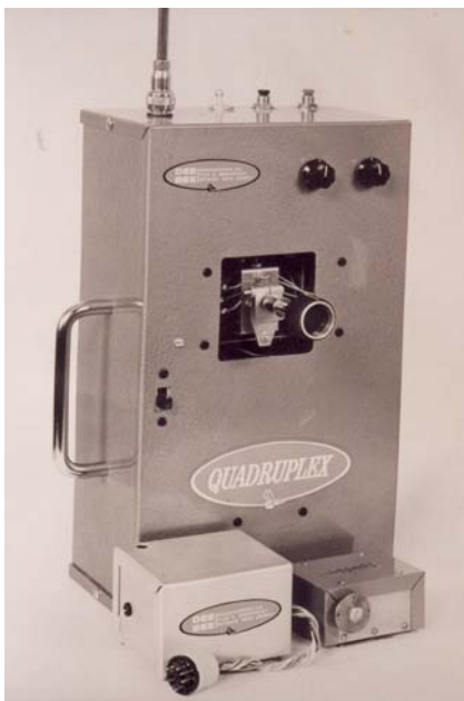
Production version of MKII Quadruplex.