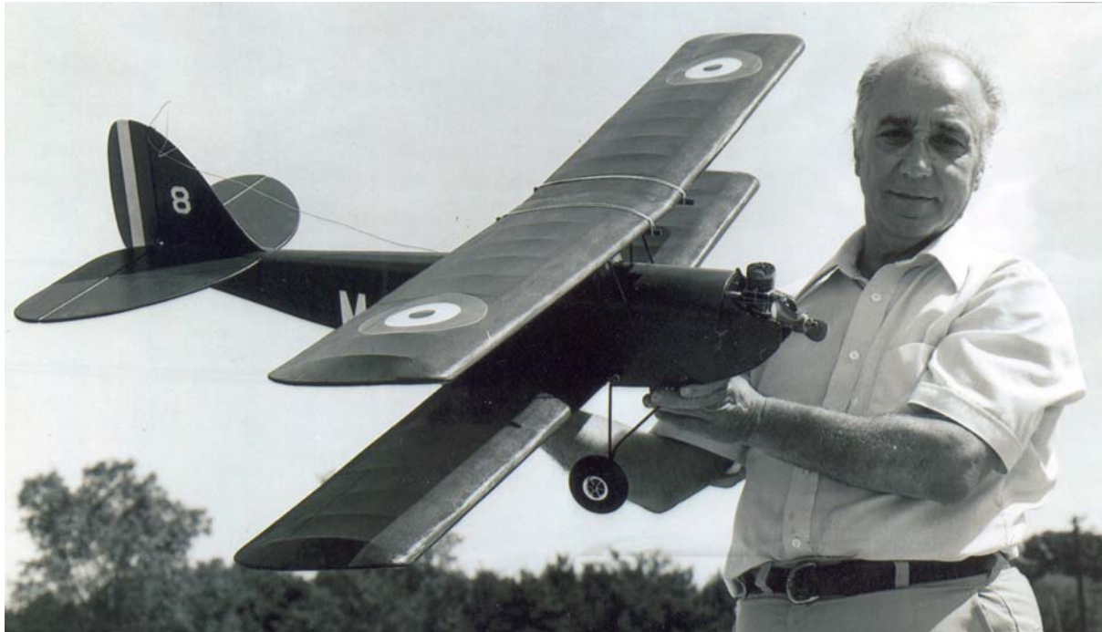
Leo at age 65 with a sport bi-plane.