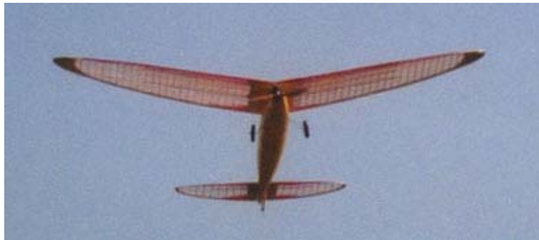
July 2005 – Shacklett's Valkyrie in the air.