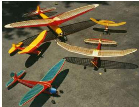
A Goldberg Gathering: (Clockwise, from large upper-left model) Valkyrie, Interceptor, Sailplane, Clipper and Zipper