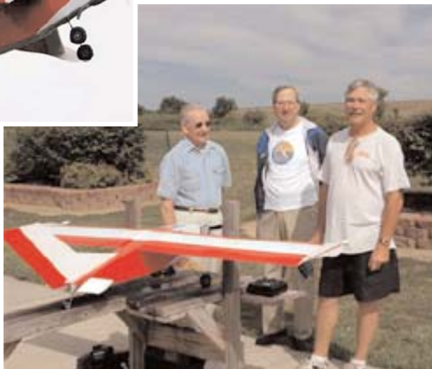
At Right: Freewing creators and test pilots

Now the bad news. At the end of the fourth flight, Neil took control and prepared to land. At the east end of the runway and close to the road, he suddenly had no control on any channel. The airplane went in nose down with significant engine power. It was badly damaged. The fuselage was demolished but wing damage was minor. At first, it looked like a winter project to rebuild, but after sorting things out, reasonable progress on rebuilding has already been made.