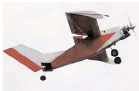
Above: Freewing in flight

On the next attempt, Neil made two flights that were flawless. In flight, the airplane looks like any other most of the time, but not always. The angle of attack of the fuselage is controlled, completely independent of the wing, by small horizontal stabilizers located at the rear. By deflecting these surfaces, the angle of the engine thrust can be "vectored" to help provide additional lift, allowing very slow minimum flight speeds. In the model, the stabilator has three positions. In the normal position, the airplane in flight appears as any other. The second position creates a moderate nose-up attitude, while the third might be called extreme. It creates a fuselage angle of attack approximately 45° larger than that of the wing. It looks a bit weird, but is completely controllable. Neil flew two more flights, doing loops, and even inverted flight. To a bystander, these appeared the same as they would for a conventional airplane. Then Orin flew, using a buddy box with Neil. All went well until the landing when the airplane flipped over its nose. A little practice should correct that.