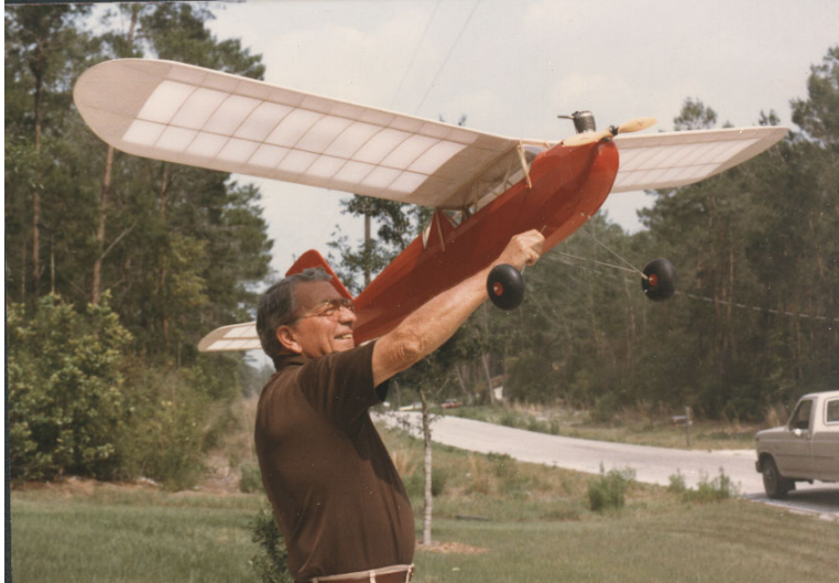
c. 1985: The Buccaneer that won the Texaco event at SAM Nats

This PDF is property of the Academy of Model Aeronautics. Permission must be granted by the AMA History Project for any reprint or duplication for public use.