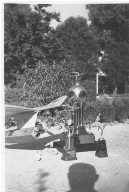
Nats trophies from 1939, 1940, and 1941