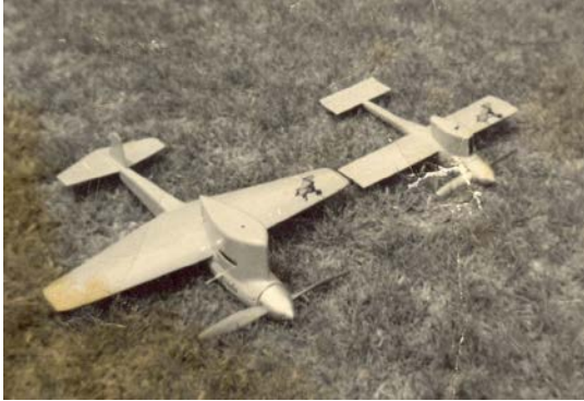
c. 1949: The Pacemaker 60 with an Ohlsson .29, Speed ships.