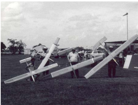
From left to right: two standard Gulf Coasters and two 12-inch Coasters. The photo was taken in Houston.