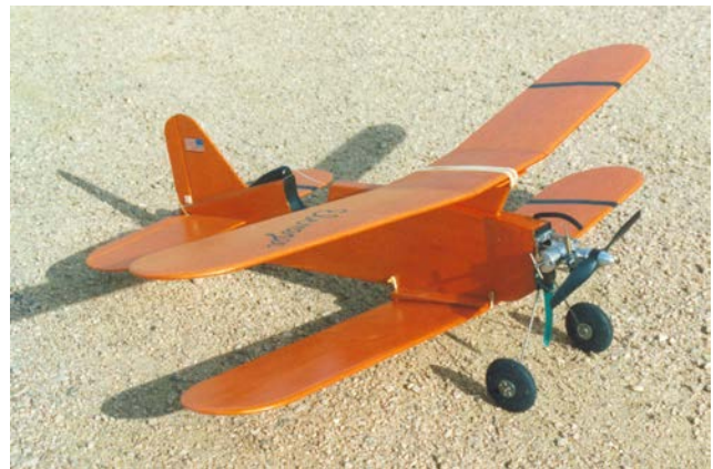
The Ebenezer Radio Control airplane