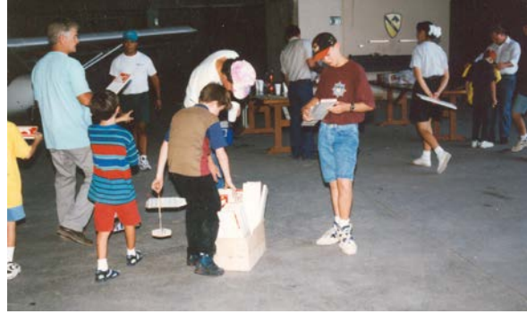
Give-away kits at the Cub Scout contest.