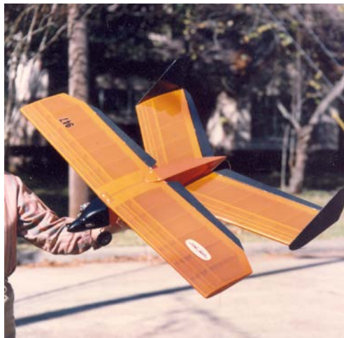
1992: Bert's prototype of the Delanne Dragon Fly