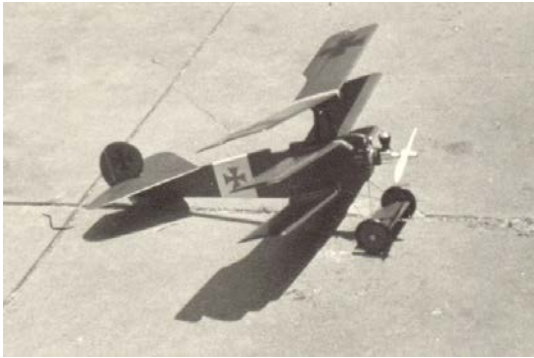
The Ebenezer Tri-plane