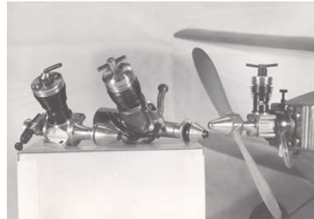
c. 1950s: The three diesel conversions Bert built. From left: Spacehopper, Fox 07 and Pee Wee

This PDF is property of the Academy of Model Aeronautics. Permission must be granted by the AMA History Project for any reprint or duplication for public use.