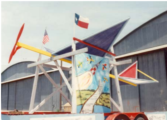
The Delta Dart on the float up close