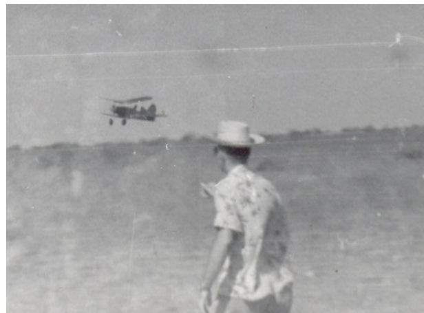
August 1954: The only picture of the flight of the very first Ebenezer. It was taken in San Antonio, Texas.