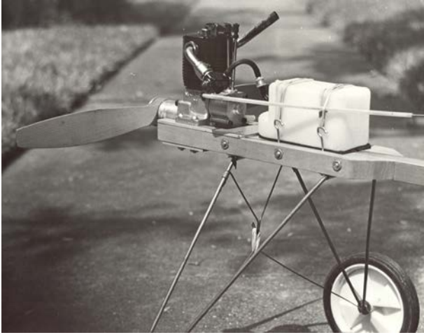
Engine installation in the Grog, a giant Rise-off-Ground model