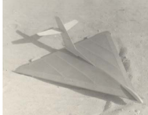
1952: Bert's Jetex Delta build in Dhahran, Saudi Arabia while he was there in the Air Force. The plane flew well and he left it in Saudi Arabia.