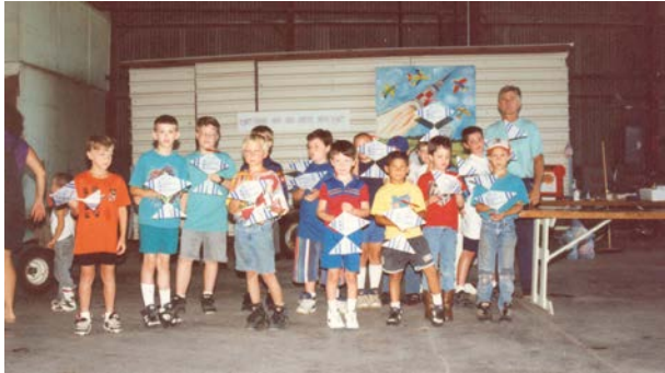
Brady Cub Scouts Delta Dart contest at Curtis Field