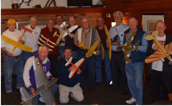
Clodbusters Model Airplane Club members.