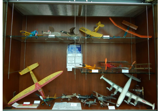
Clodbusters Model Airplane Club display at a local library.