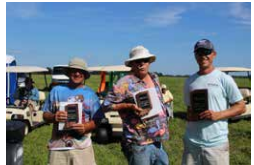
Dawn Unlimited winners.