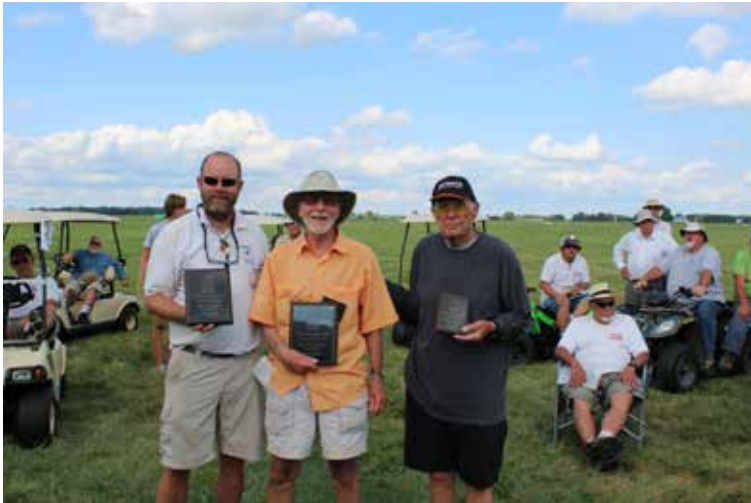
OT CAT winners.