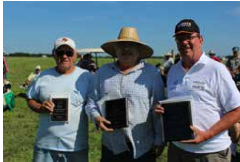
1/4A NOS Gas winners.