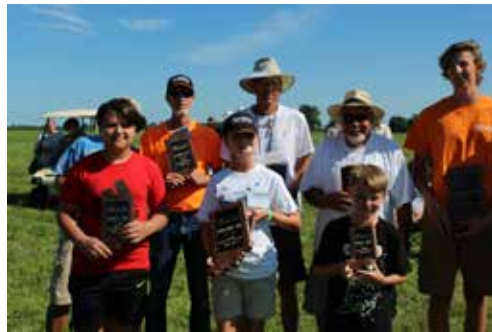
Junior P-30 winners.