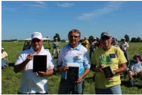
Pee Wee 30 winners.