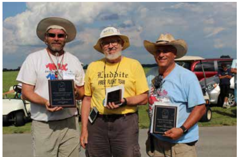
FAC Embryo winners.