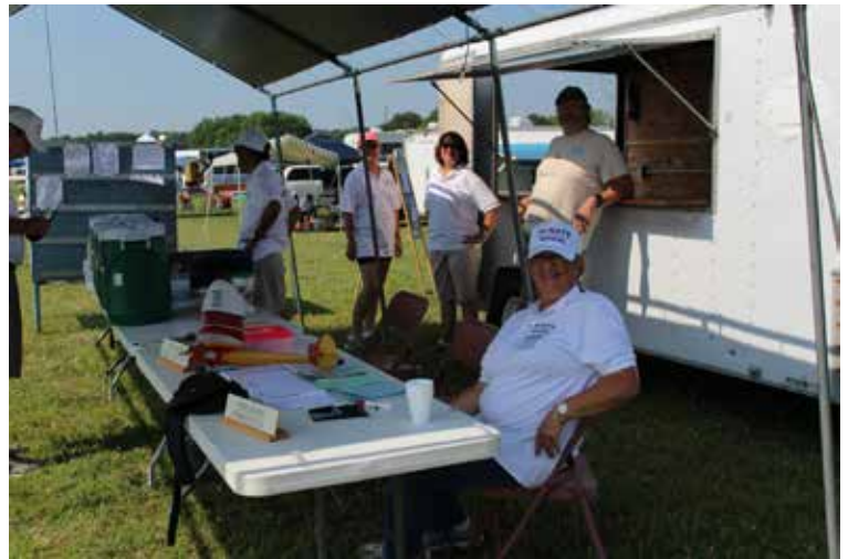
The happy processors!