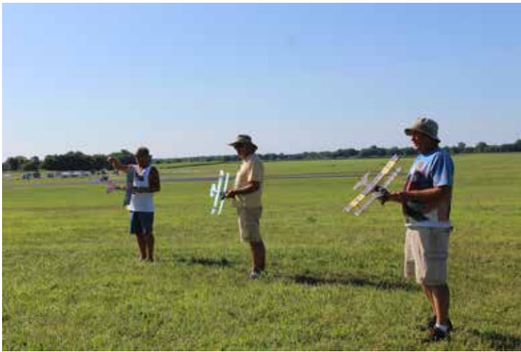
The flightline for the WW I mass launch.