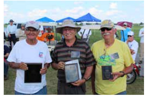
FAC SAM OT A, B, C Cabin winners.