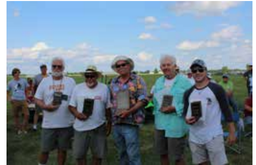
Adult Mulvihill winners.