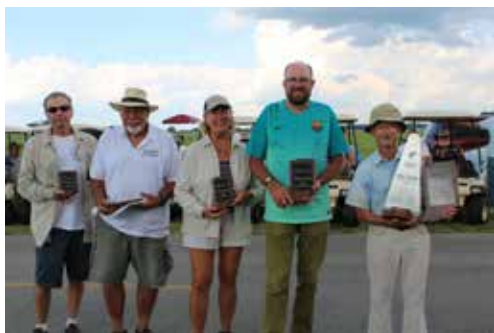
- Adult FIG winners.