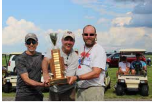
HL Glider Team Champions.