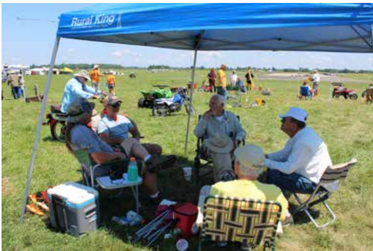
"Thermal Generation Tent."