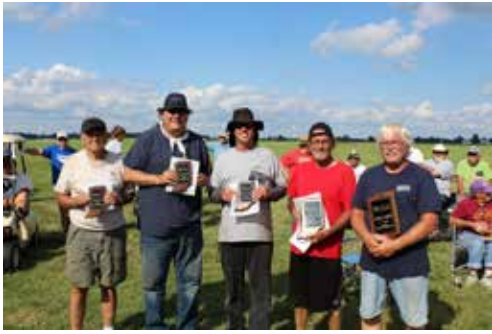
C Gas winners.