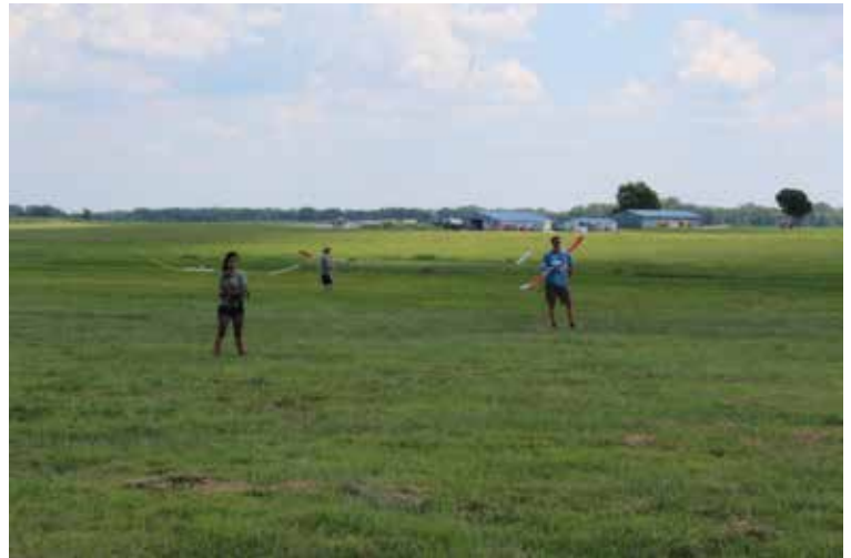
F1As at the ready.