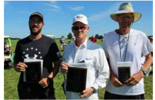
OT Rubber Stick winners.