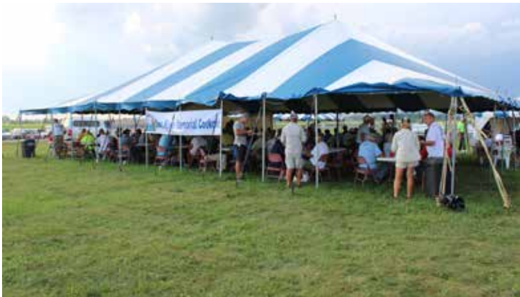
NFFS barbecue cookout tent.