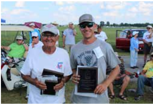
NOS Rubber winners.