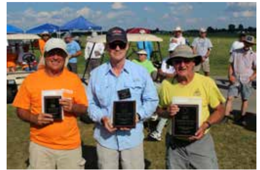
1 Design Rubber winners.