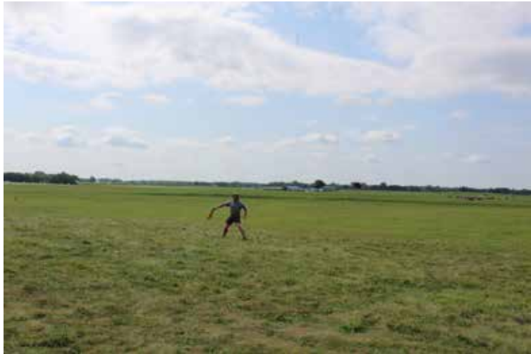
Jim Hack ready to let go!