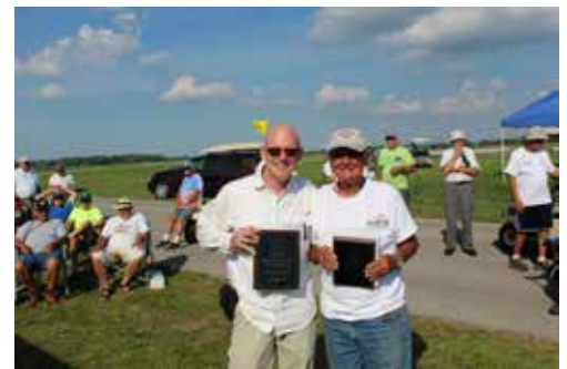
Andrade Rubber winners.