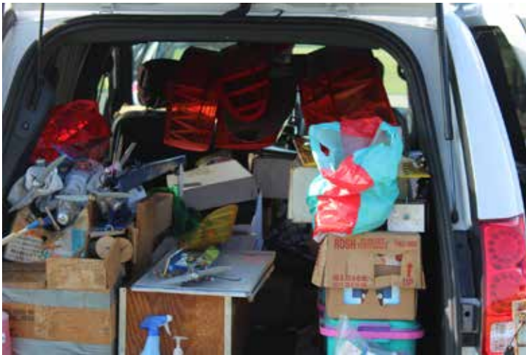
Bobby Hanford Packed in ready to go!