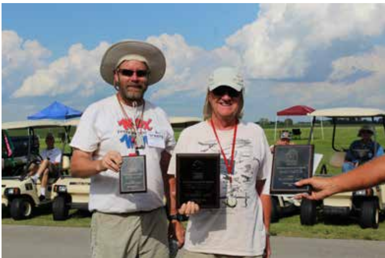
FAC OT Rubber Cabin winners.