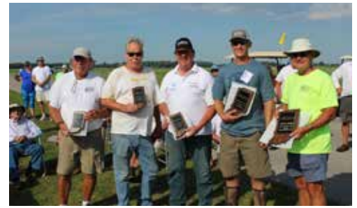
A/B Classic Gas winners.