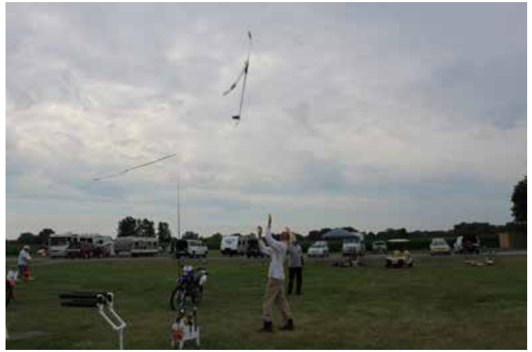
Neal Menanno in an F1C launch.