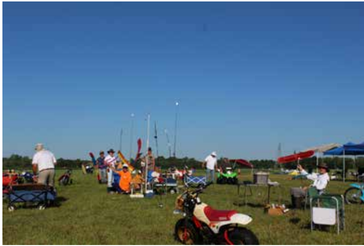
The Gas crowd showing approval.

Make an attempt to attend next year's Nats. It's a hoot. Thermals!