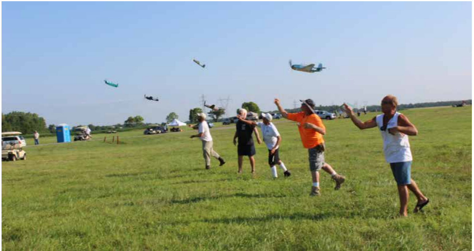
The FAC World War II mass launch.