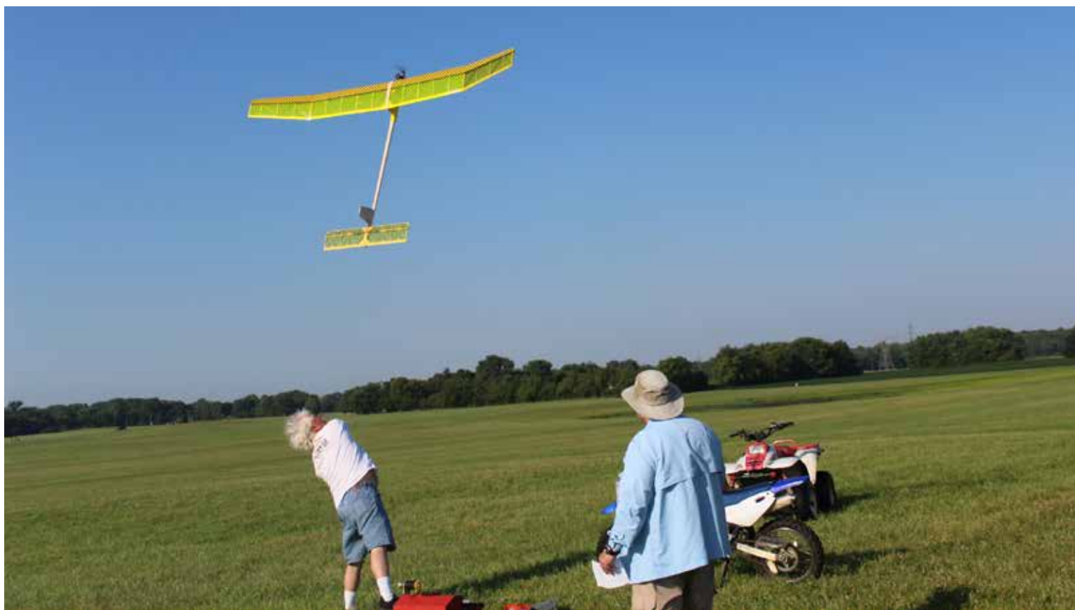
D-Gas up and away.