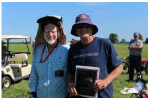
Super D Gas winners.