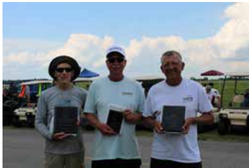
FAC Golden Age Combo winners.