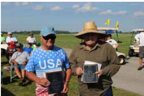
.020 Replica winners.