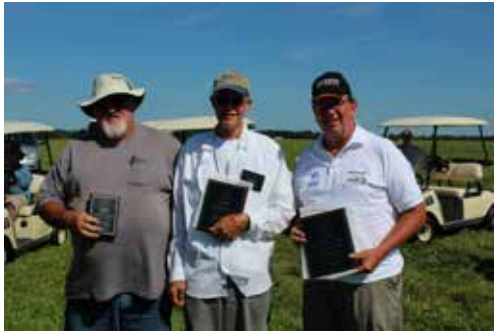
1/2A Gas winners.