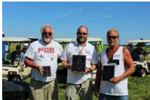
FAC Peanut Scale winners.