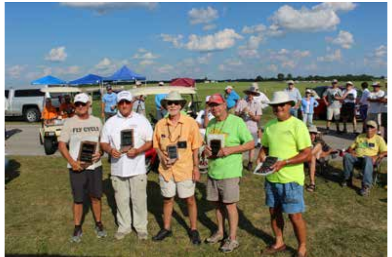
Adult HH Catapult Glider winners.