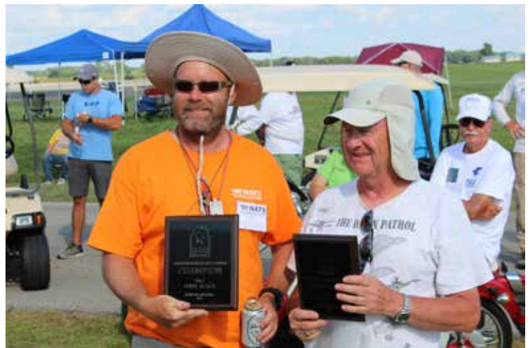
FAC Dime Scale winners.