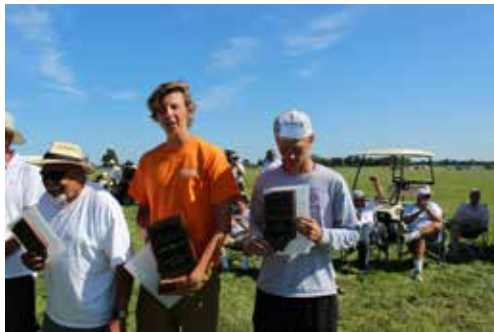
Senior P-30 winners.