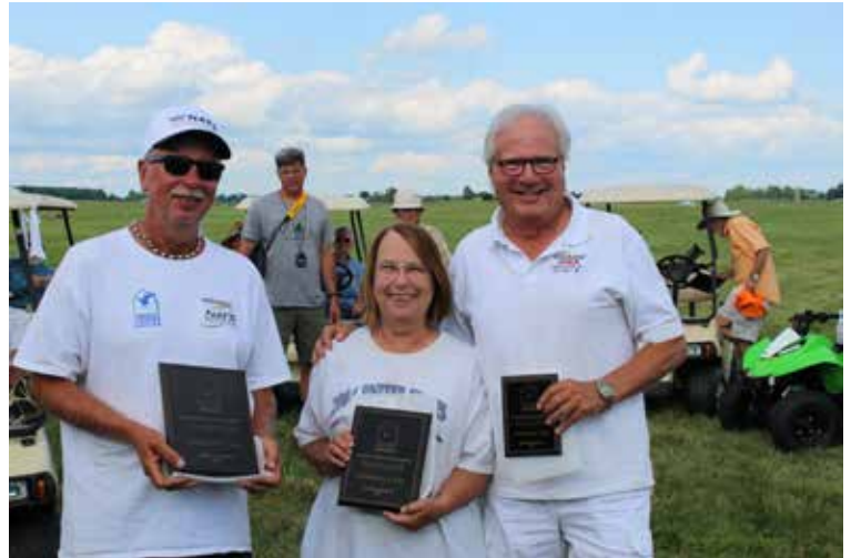
NOS A Gas winners.