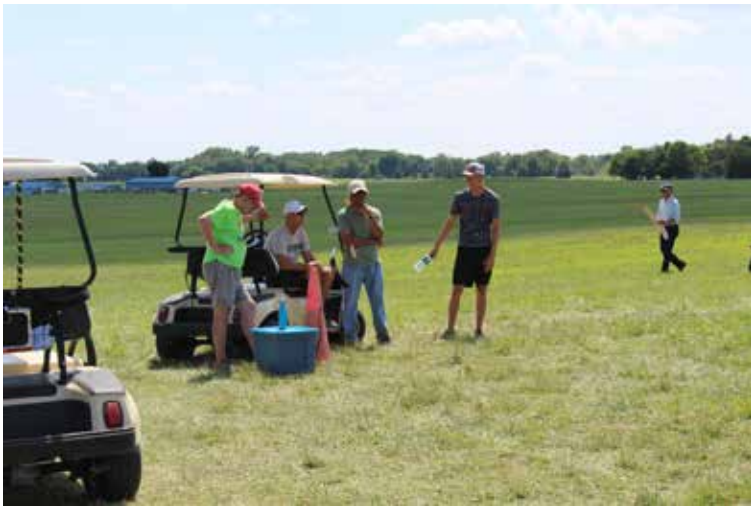
It's a good thing that advice is free.