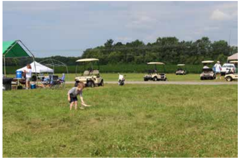
The way "I" pick up my glider!