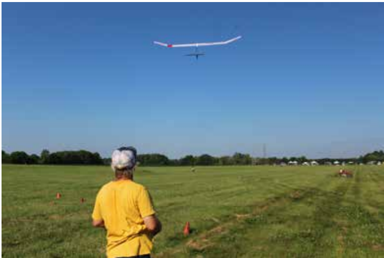
In F1A, Adelaide Ulm towing while dad, Gene, looks on.