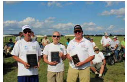
One Design Combo winners.