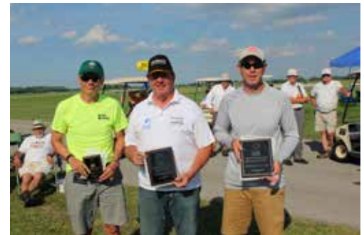
1/2A Nostalgia winners.