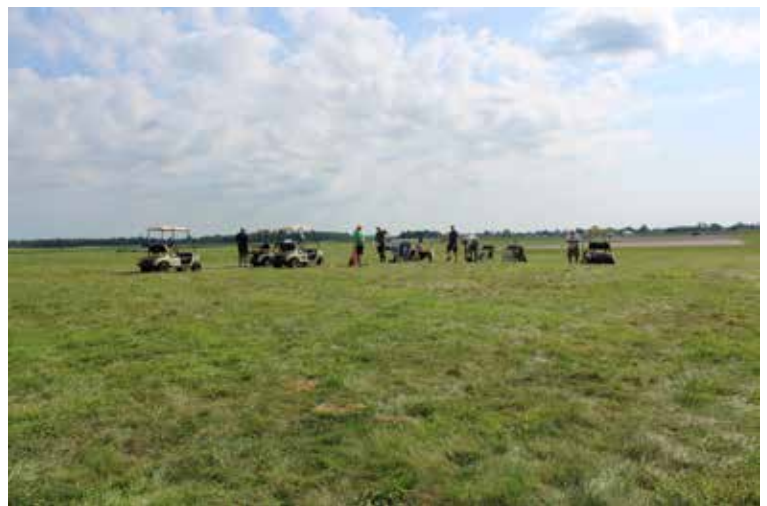
The typical action at the "pen."