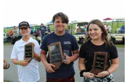
Junior and Senior FIG winners.