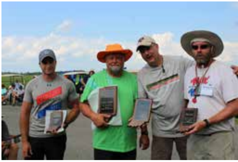
Hand Launch Glider winners.