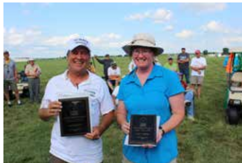
ROW Rubber winners.