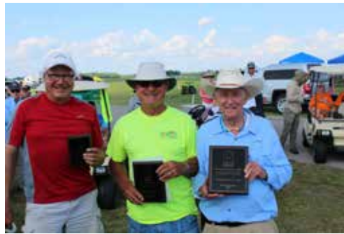
B NOS Gas winners.