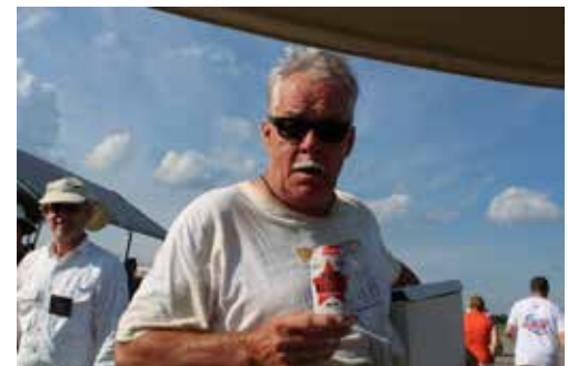
Mr. 2nd Rodeo again.