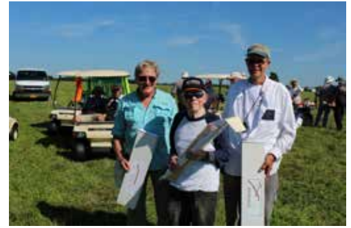
The 2019 Hi-Start winners.