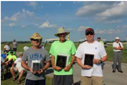
OT HLG winners.