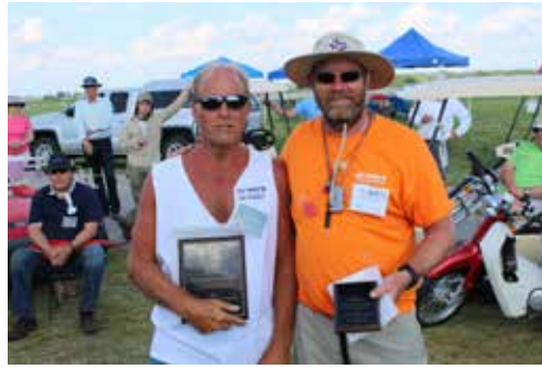
FAC Low Wing Trainer mass launch winners.