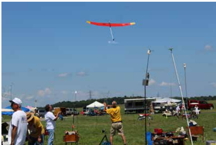
Drake Hook launching in F1J.