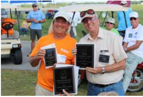
FAC Hi-Start Scale Glider winners.