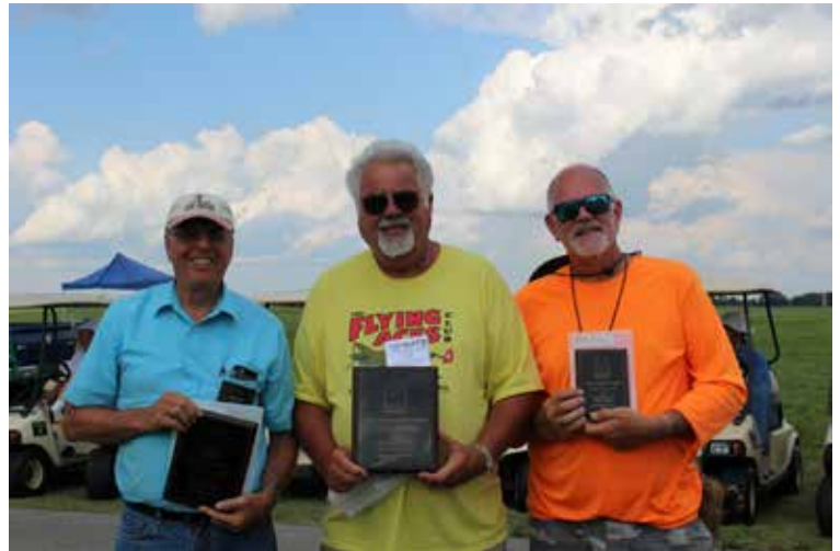
FAC Golden Age winners.