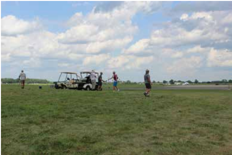
Later in the day, nothing had changed much.