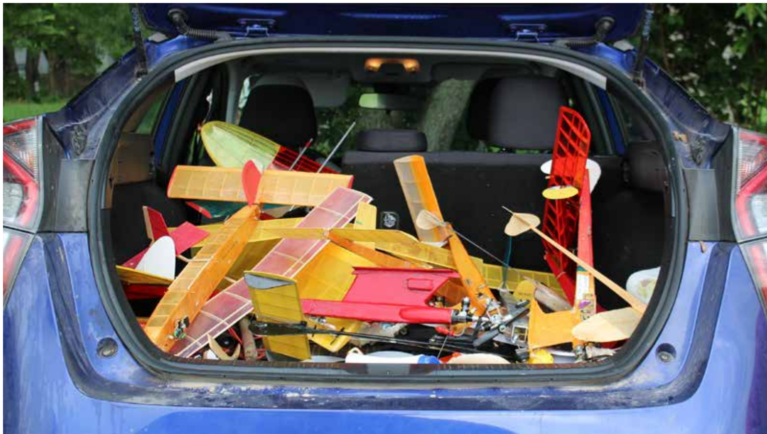
A well-packaged trunk for FF!