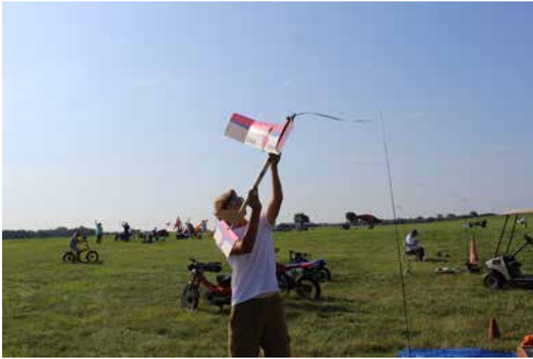
Roman Stalick's launching technique.