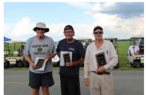
A Gas winners.