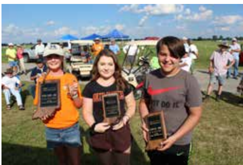
Junior/Senior E-36 Electric winners.