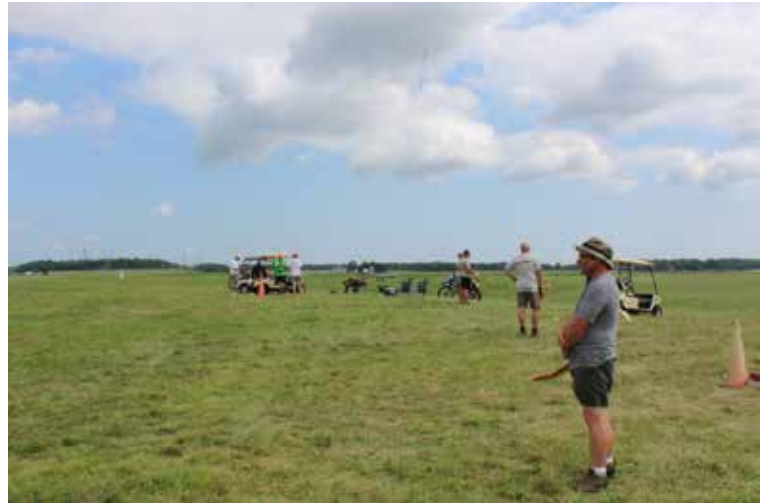
More launch pen excitement.