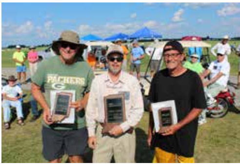
1/2A Classic Gas winners.