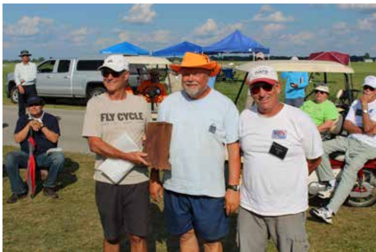
Team Catapult winners.