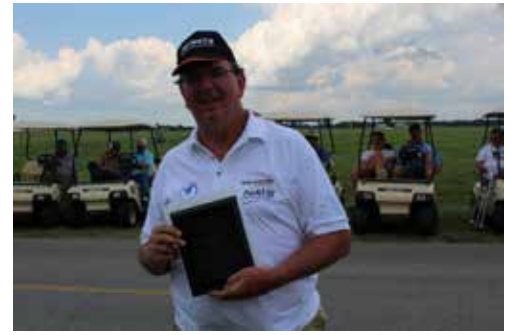
NOS Rubber 2nd-place winner.