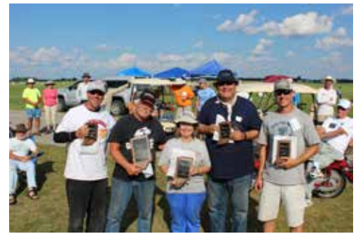
B Gas winners.