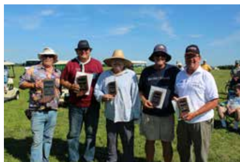
CD Classic Gas winners.