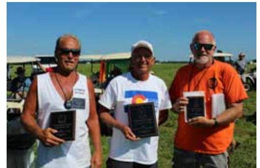
FAC Civilian Scale winners.