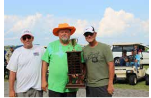
Catapult Glider Team Champions.