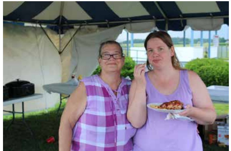
Carol Kane and her daughter ... pit masters.