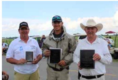
NOS C Gas winners.