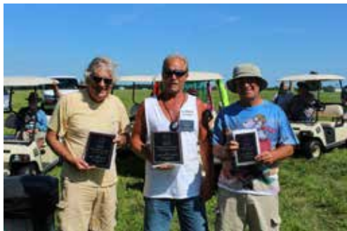
FAC WW I Mass Launch winners.