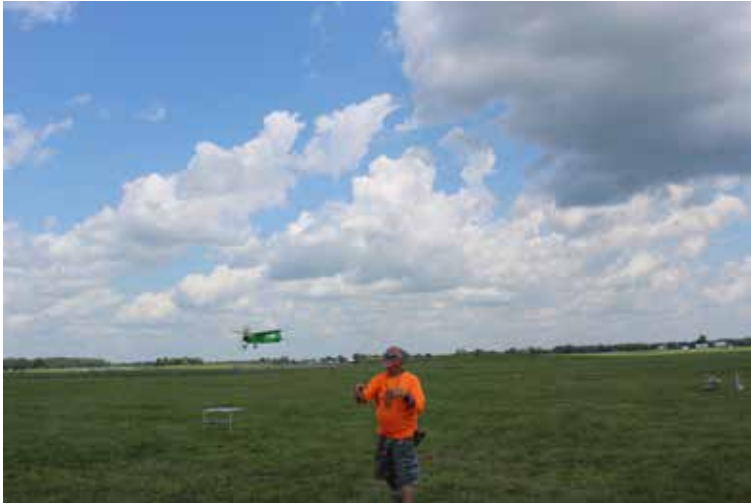
George's smooch must have done some good ... it flies!