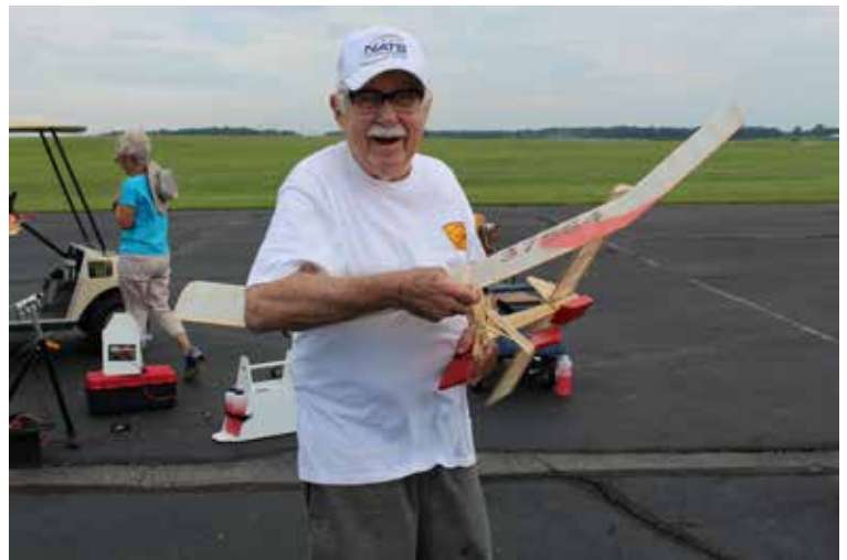
Jim Kelly accepting the agony of defeat.