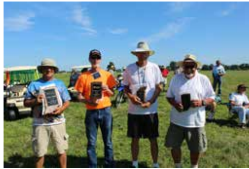
Adult P-30 winners.