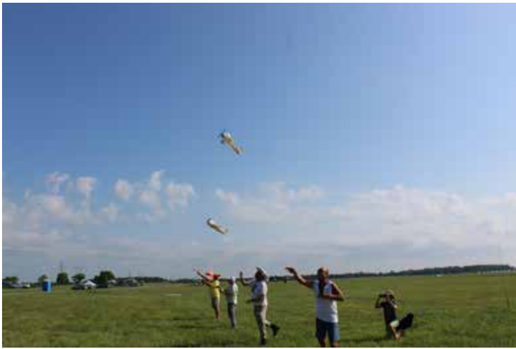
FAC Greve/Thompson mass launch.