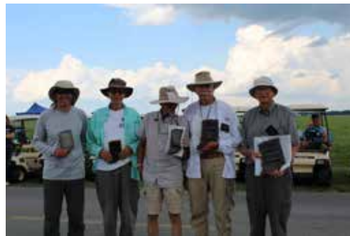
A Electric winners.