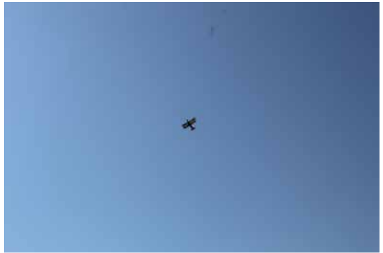
Pat Murray's Fokker flying overhead.