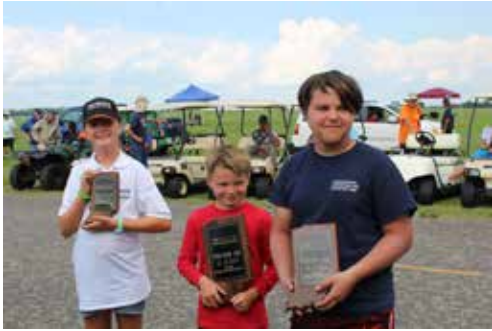
Junior HL Glider winners.