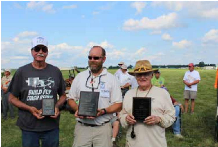
SAM OT Rubber Cabin.