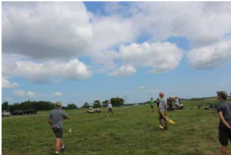
Kurt Krempets' toss in the upper left-hand corner.