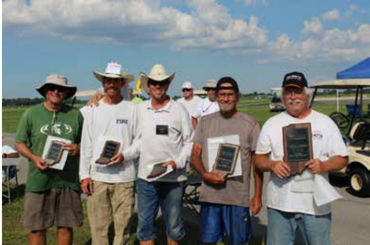
D Gas winners.