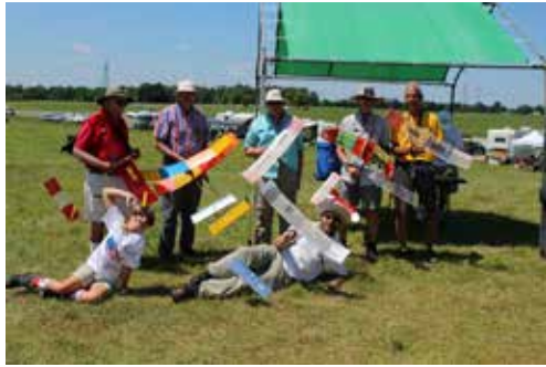
The F1S flyoff crowd ... 7 of them!