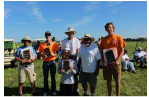
Adult and Senior P-30 winners.