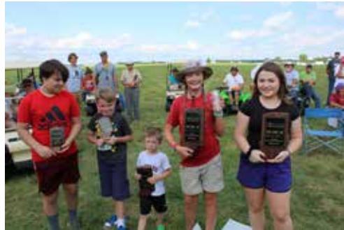
Junior and Senior Mulvihill winners.