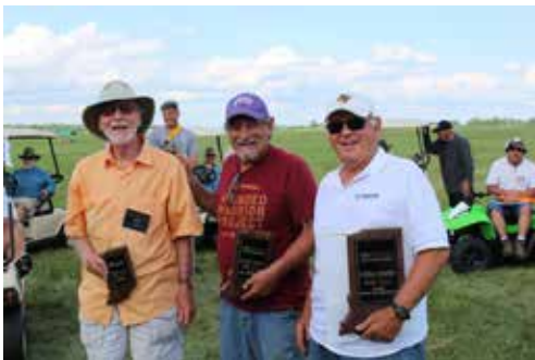
ROW Gas winners.