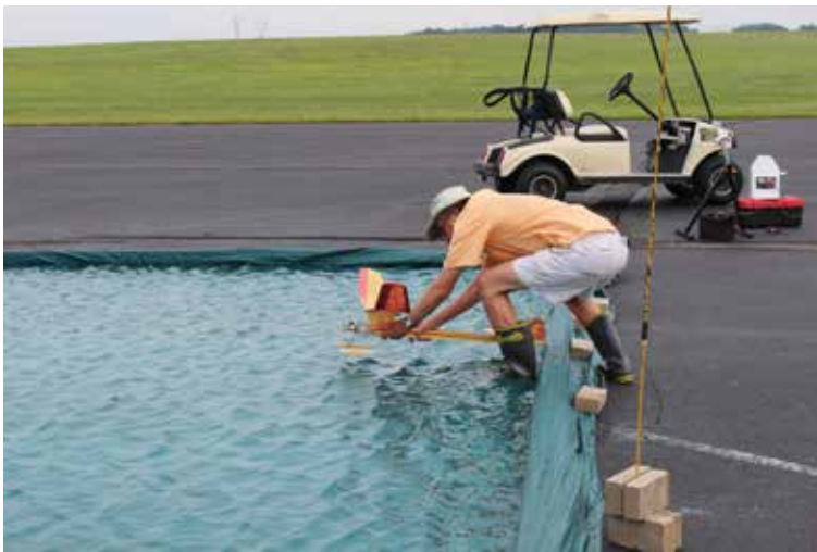
Kit Bay's ROW not quite lifting off the water.