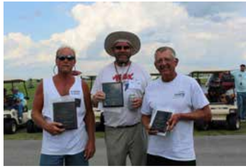
FAC WW II mass launch winners.