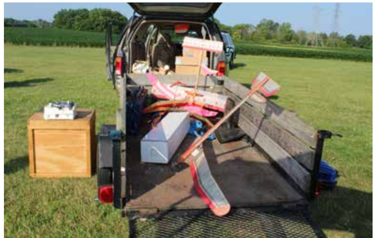
What if you can't find enough room in the car?