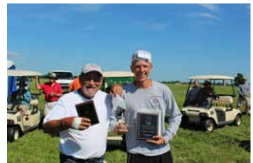
Classic Towline winners.