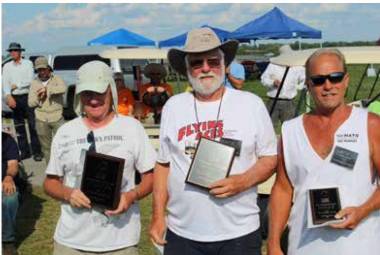
FAC OT Rubber Stick winners.