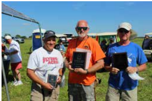
FAC Rubber winners.