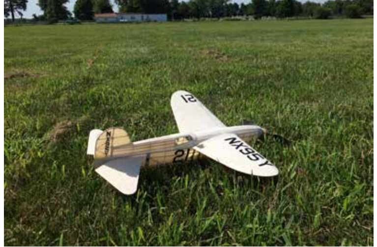
Beautifully detailed Free Flight model.