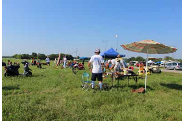
Down the flightline.