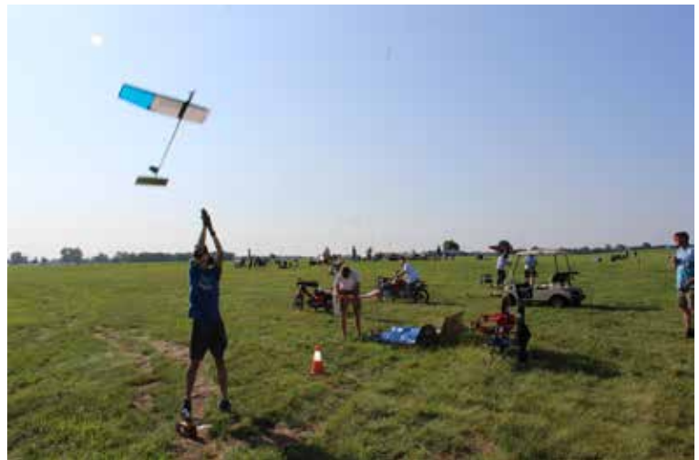
Hayden Ashworth launching F1P.