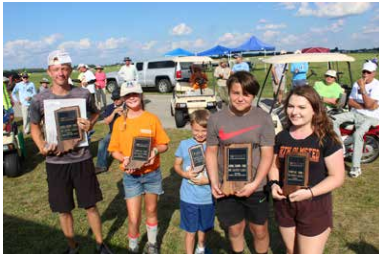
Junior HH Catapult Glider winners.