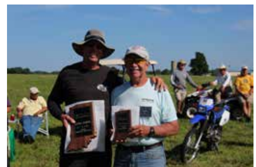
1/2A Classic Gas winners.