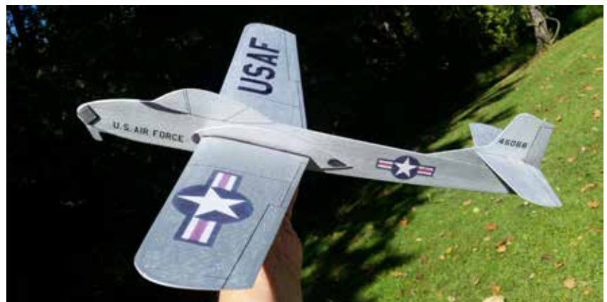
Randall Krystosek's T-37 Jet Cat that flew an amazing 12:15 flight. He hooked a thermal to take first place.