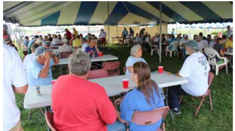
Inside the tent.