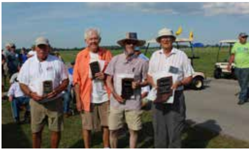
B Electric winners.