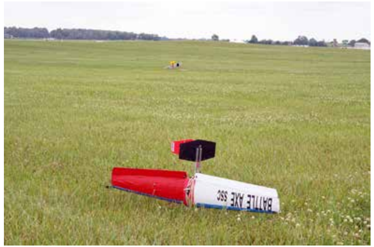
These combat planes are fully grown and ready to be picked.