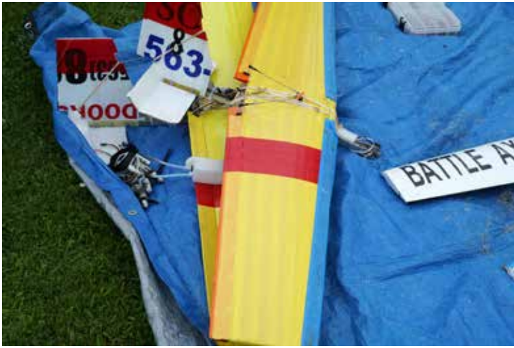
Umm ... Dirk, the motors usually go on the front of the plane.