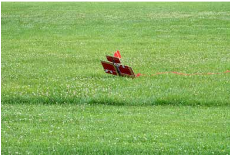
They just keep popping up all over Muncie.