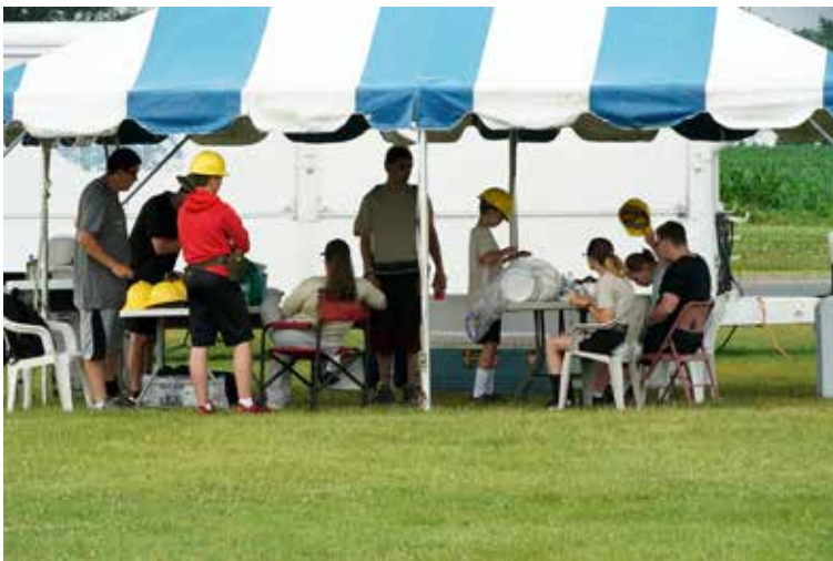
Civil Air Patrol Cadets going through their morning briefing.