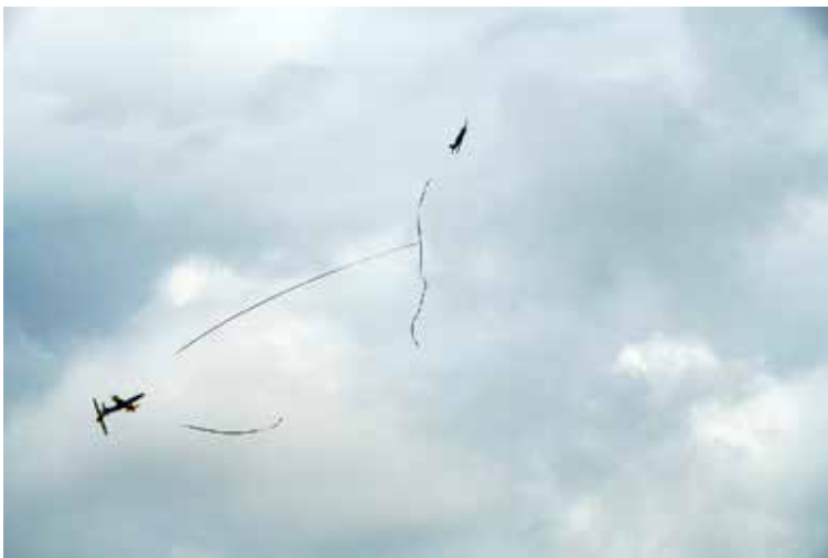
Some Scale 2948 action.