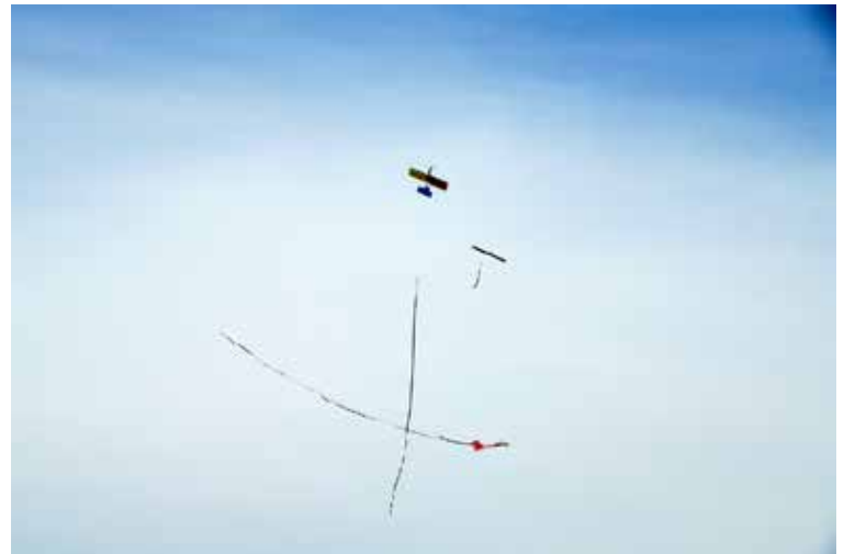
Some E-1000 action after the official events wrapped up for the day.