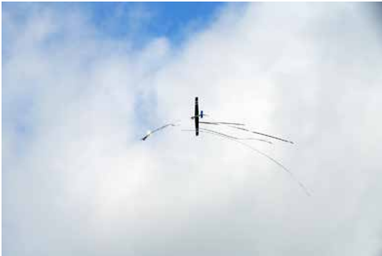
Andy Runte lining up one of many cuts today.