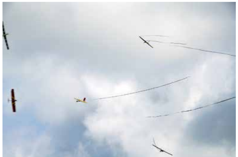
Getting the furball going.