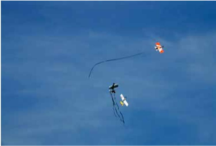
Top Wisconsin boys mixing it up.