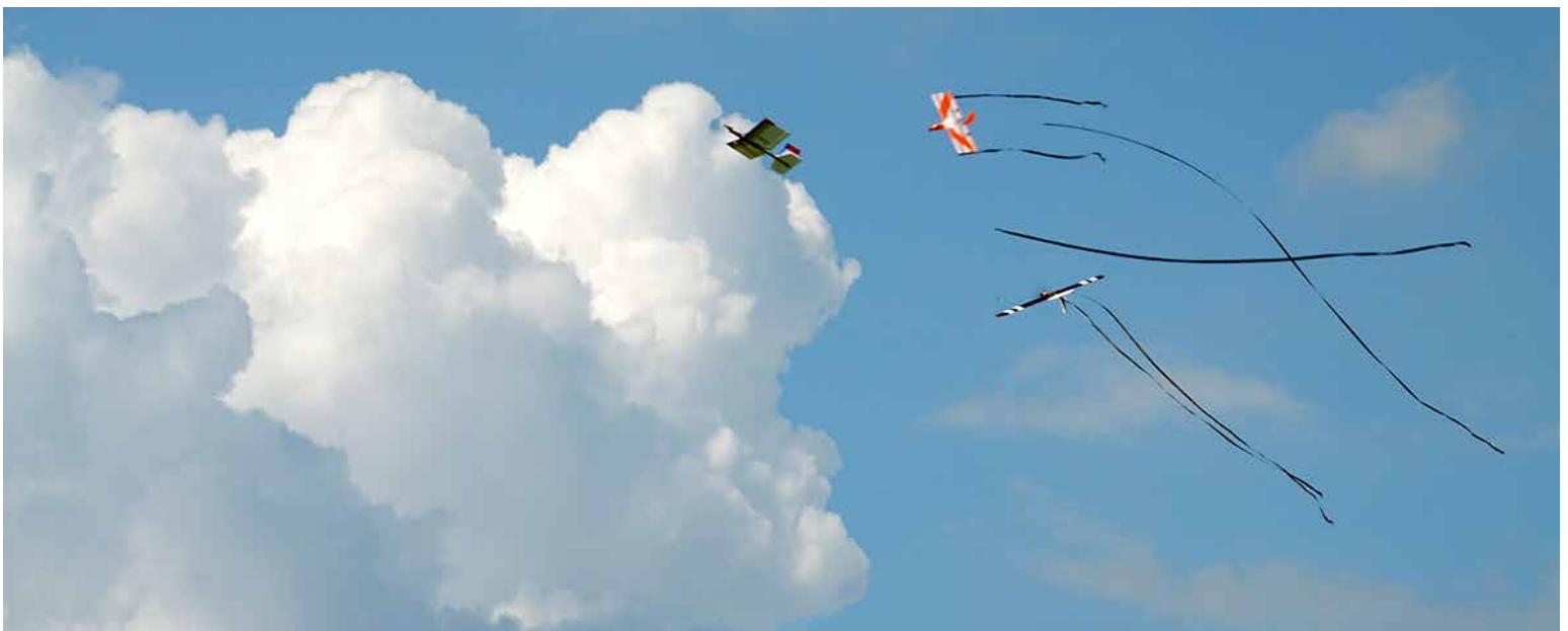
E-1000 action keeping the action up close today.