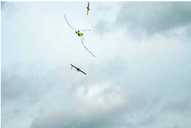
George Pritchett reaching up to grab another streamer.