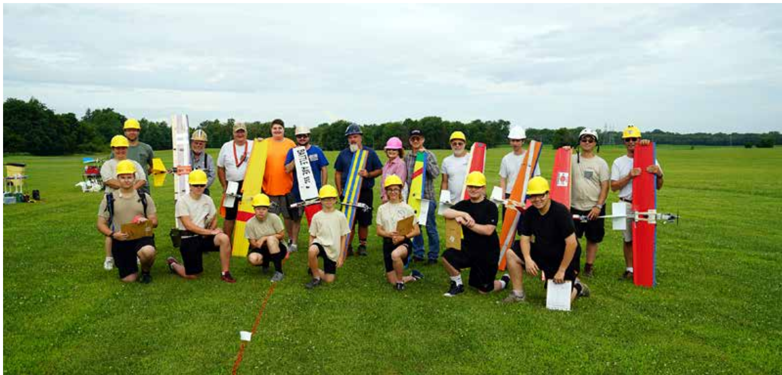
SSC pilots and Civil Air Patrol Cadet judges.