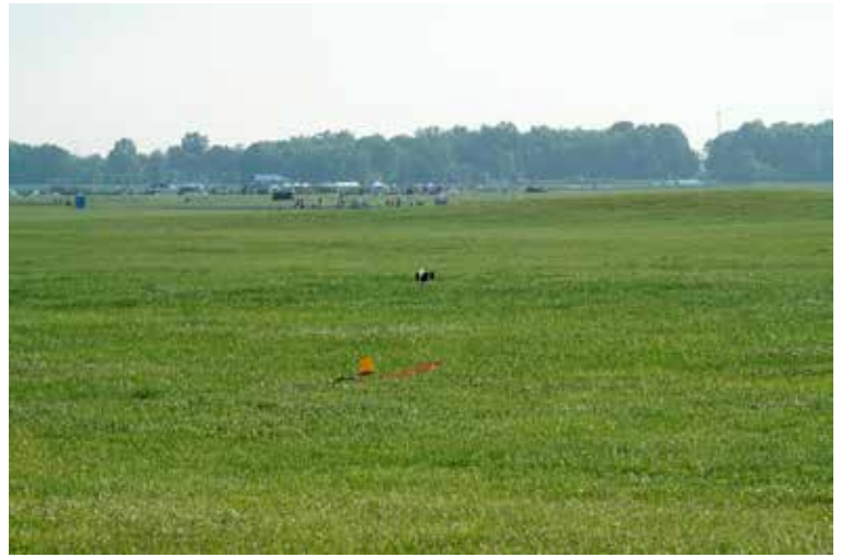
One GNAT ripe to pick and one that needs more time.