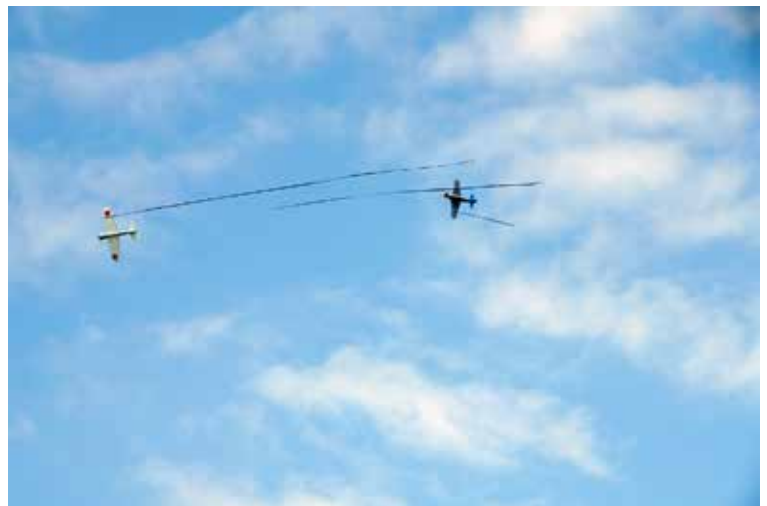
Mike LaPacz lining up for a hard to get cut in Scale 2948.