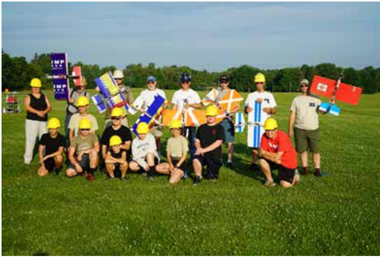
GNAT group photo.