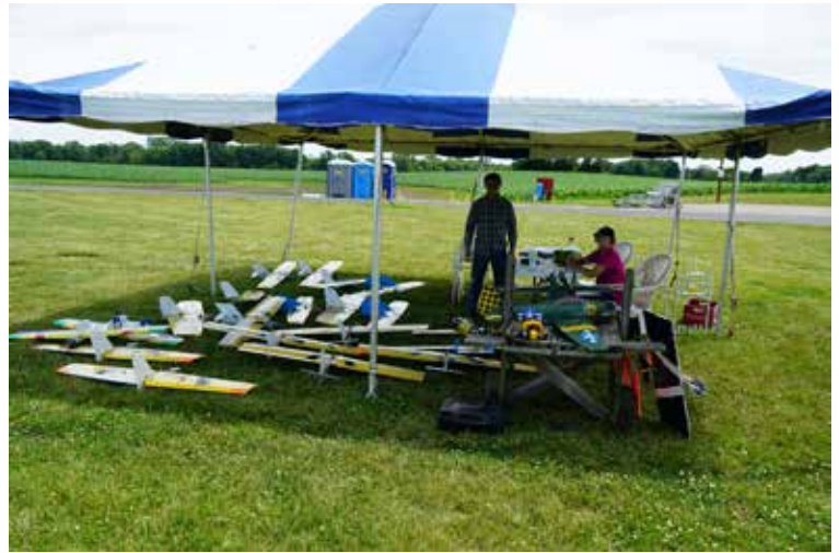
George Pritchett's fleet all ready to go.