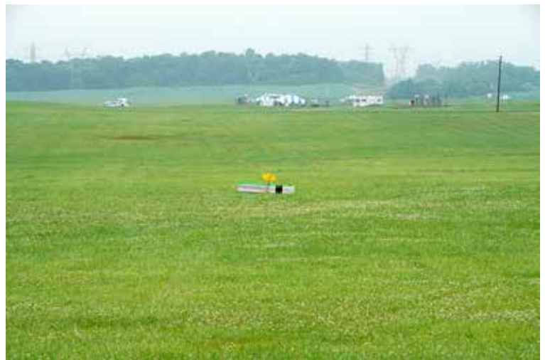
Once again there's a combat plane ready to be picked. Muncie sure does grow them fast.