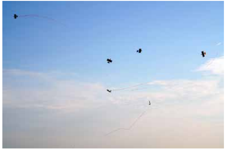
Some early morning GNAT action.