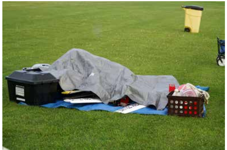
The Oosting's fleet in rain gear.