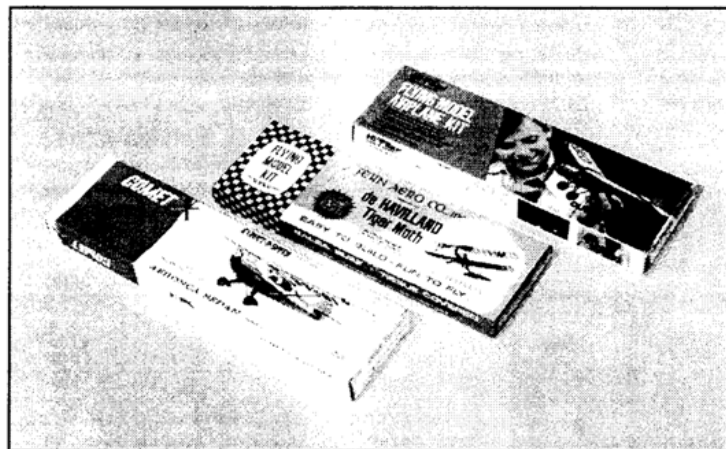
Kits from the Tern Aero Company.