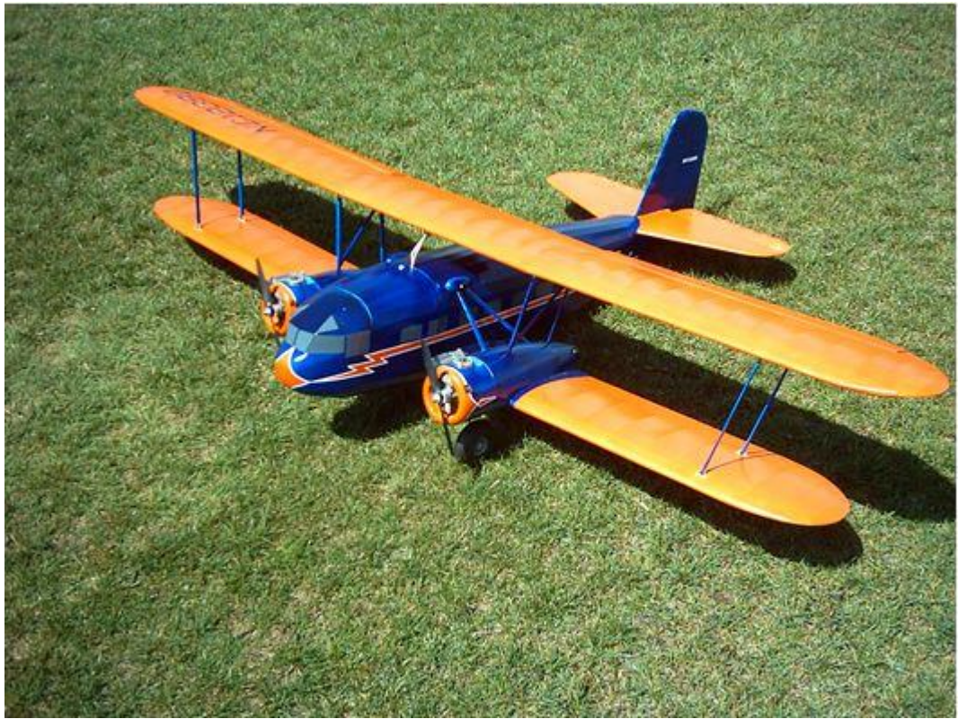
Curtiss Condor, 60'' WS, Magnum .15 engines