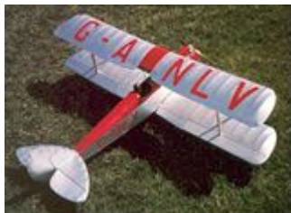
Gipsy Moth British