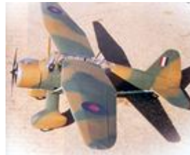
Westland Lysander British