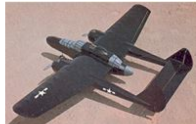
P-61 Black Widow