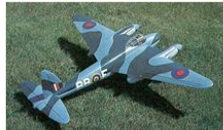
DH 98 Mosquito British