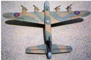
Short Sterling British