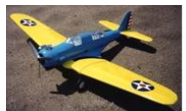
Northrop A-17 Retractable landing gear