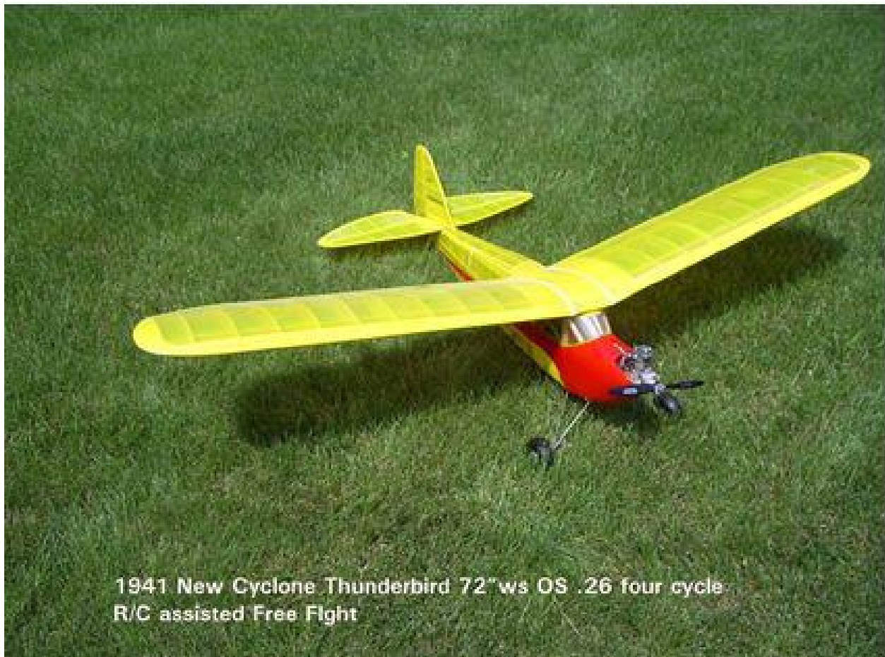
1941 New Cyclone Thunderbird 72"ws OS .26 four cycle R/C assisted Free Flight