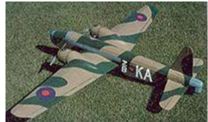
Vicker's Wellington British