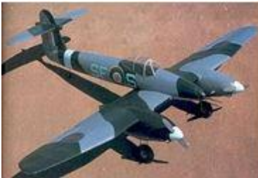
Westland Whirlwind British