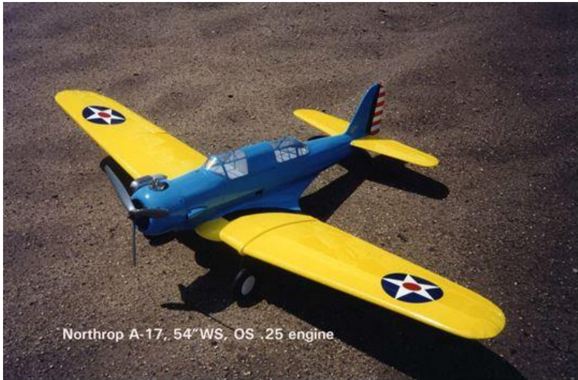
Northrop A-17, 54"WS, OS .25 engine