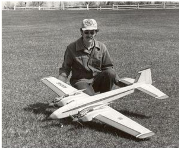
1978: Dick's Magnum 80 design. It was a 76-inch wingspan aerobatic pattern ship powered by two K&B .40s with tuned pipes. It flew fast and furious. This plane was featured in a construction article in Flying Models magazine.