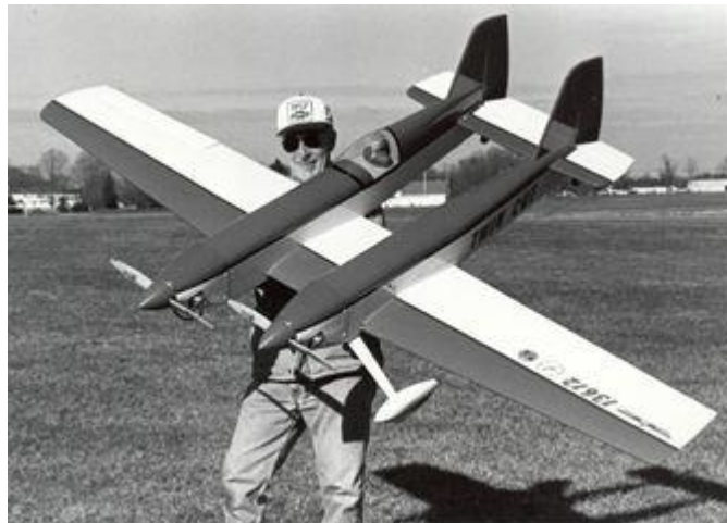
1998: Dick with his Twin Cut, an aerobatic twin-engine design. It had a unique layout, unequal length fuselage, gas burner engines, and overlapping propellers. The 104-inch wingspan model was featured in a construction article in Model Aviation magazine.