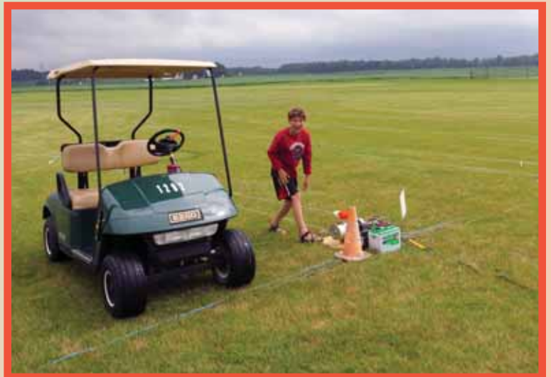
Veteran winch trolls Ethan and Daniel Gess have become regulars here. Bring your kids and grandkids to join the crew! They can learn to drive without risking your expensive vehicle. (We teach them about safety, too.)