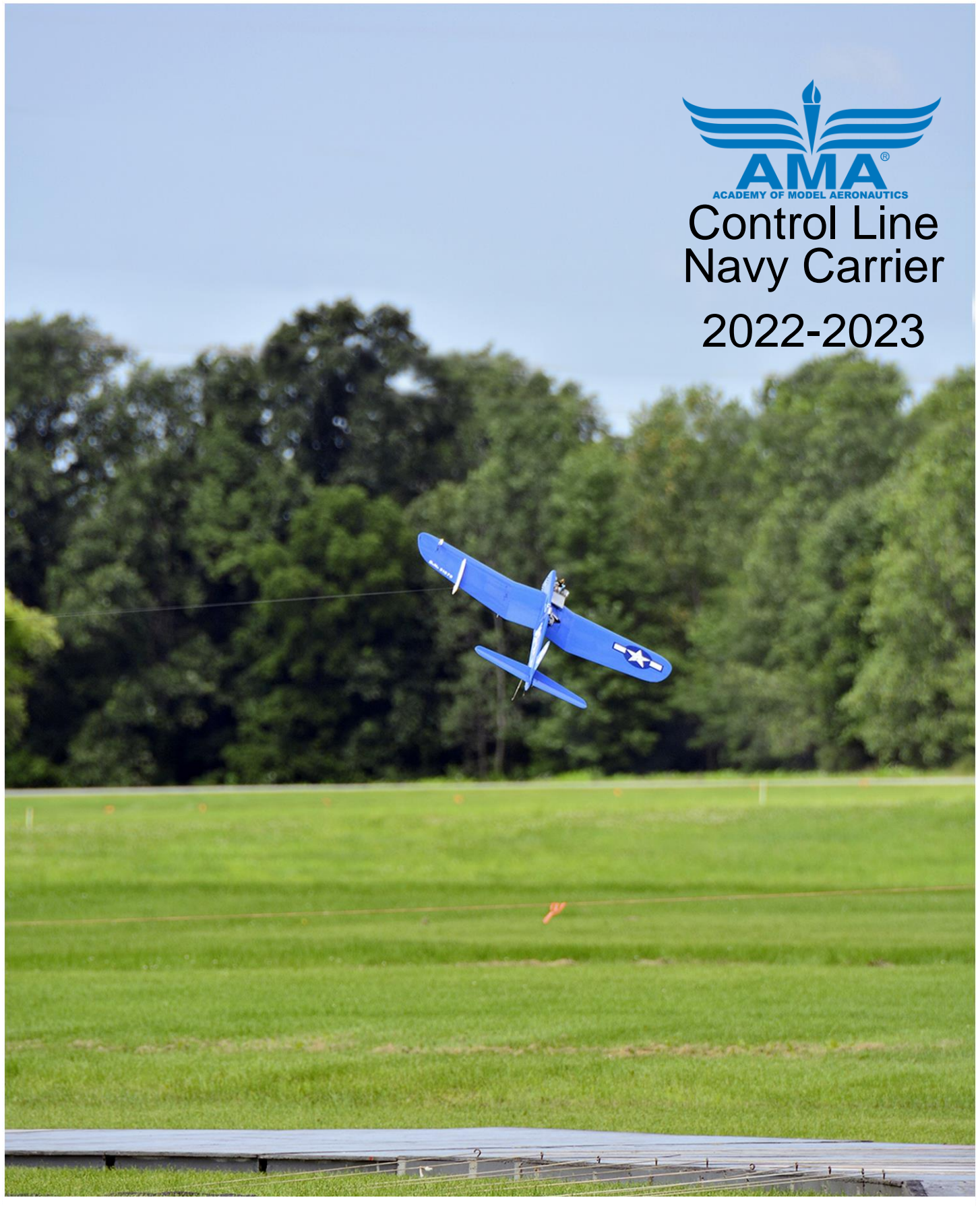
RULES GOVERNING MODEL AVIATION COMPETITION IN THE UNITED STATES