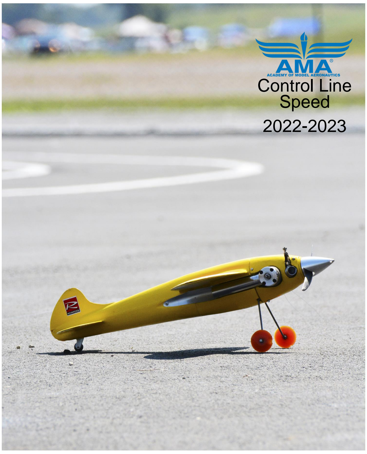
RULES GOVERNING MODEL AVIATION COMPETITION IN THE UNITED STATES