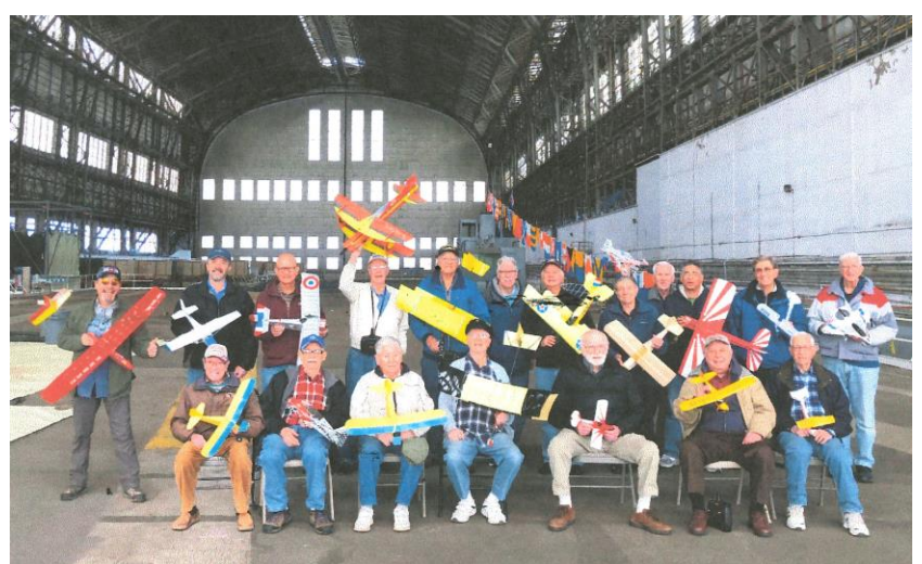
Group picture of the regular "ECIM Slow Flyers" on Saturday, March 30, 2019.

This PDF is property of the Academy of Model Aeronautics. Permission must be granted by the AMA History Project for any reprint or duplication for public use.