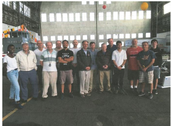
Group picture of Free Flight FAI/F1D team trials participants Labor Day 2017.