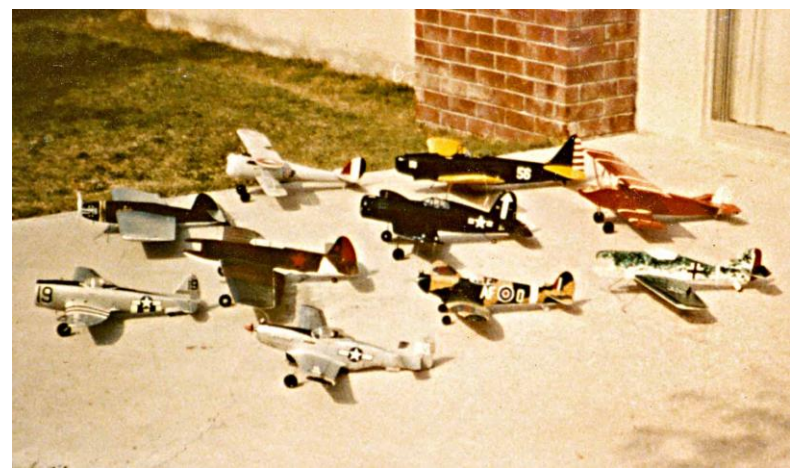
Chuck's "Air Force."

My name is Chuck Felton and for most of my life I have been enjoying the wonderful hobby of building and flying control line model aircraft. I started building and flying balsa control line model kits in 1950 when I was 12 years old. As you can see below, my "Air Force" kept me busy.