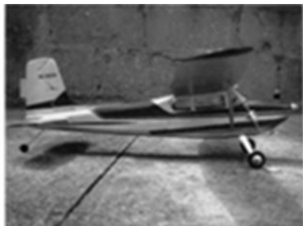
Berkeley Casina 182 semi-scale 1/2A FF Cox Thruster Drone .049 engine - 1955