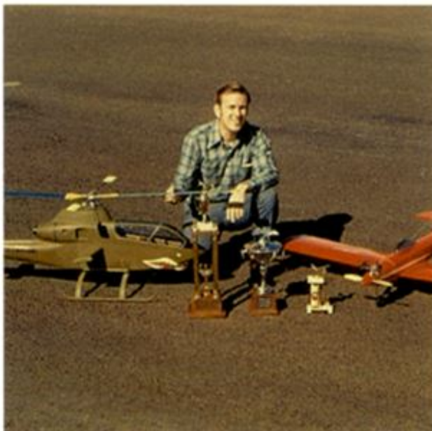
Cobra and Kwik-Fli pattern ship - 1st in Helis, Eveready Grand Champion & 5th place pattern trophies - 1972 LIDS meet