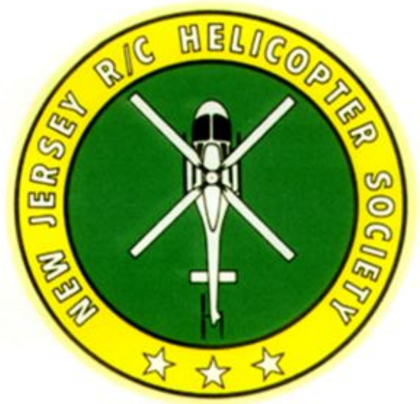
AMA chartered Club #1309 | founded in 1979