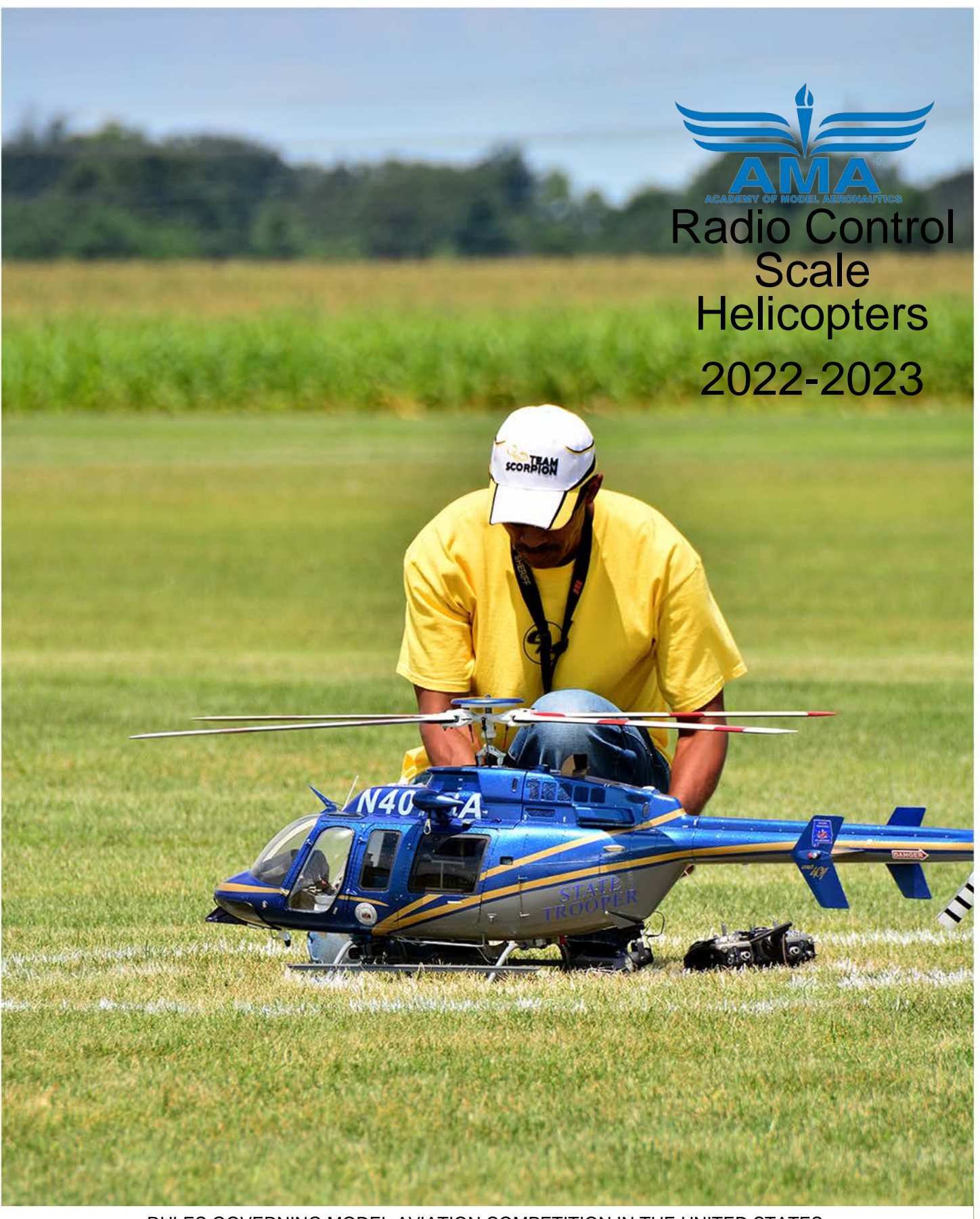
RULES GOVERNING MODEL AVIATION COMPETITION IN THE UNITED STATES