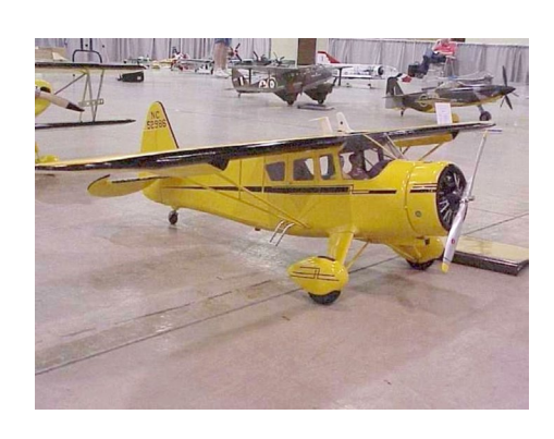
Circa early 1990s: My three-time CL Scale-winning Howard DGA-15.