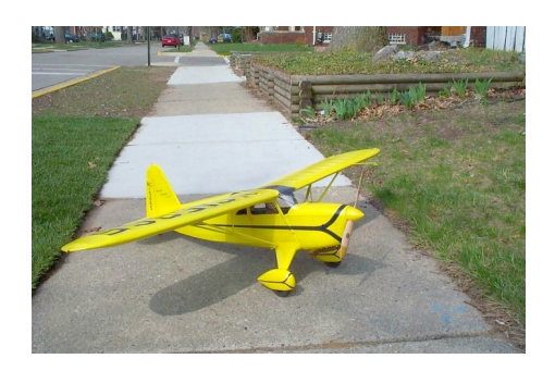
Circa 1993/1994: CL Scale Rearwin Speedster M-6000C Speedster built for my last competitive AMA Nationals competition, flown in about 1993 or 1994. One of my favorite aircraft.