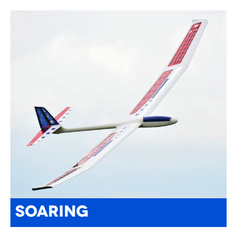
Glide silently through the sky using only the wind.