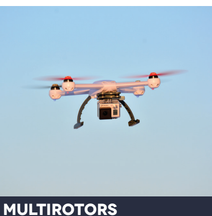
Control every aspect of your flight with a radio transmitter.

Experience the latest in aeromodeling technology.