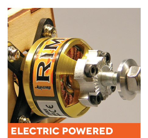
Enjoy quiet power on demand with electric motors.