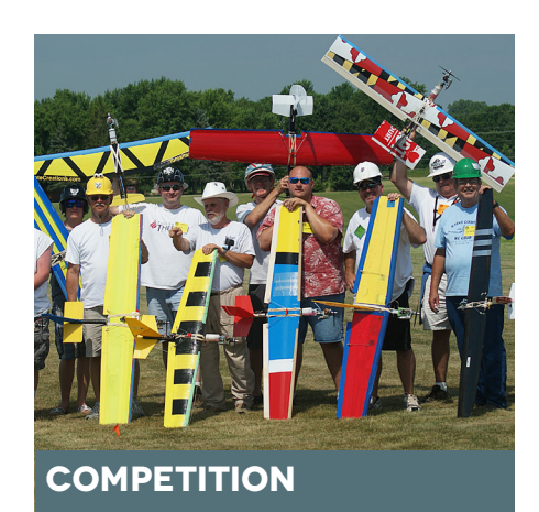
Earn your stripes and test your skill in airborne dogfights.