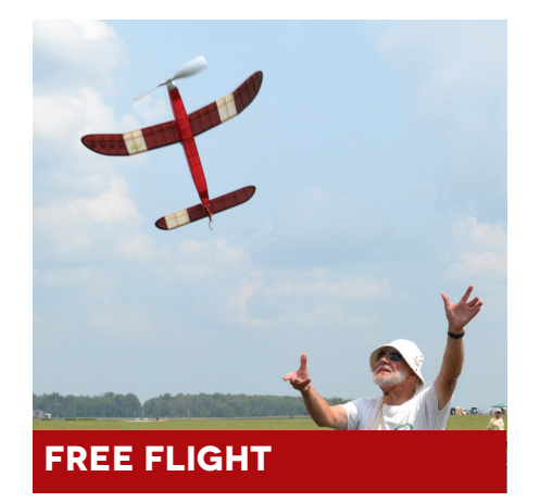
Carefully engineer your plane to stay aloft on its own.