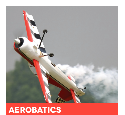
Captivate an audience with thrilling performances.

The myriad options available to hobbyists and competitors today have made model flying more diverse than ever. Models, gatherings, and even competitions exist for pilots of all skill levels and many interests—just a few of which are shown here.