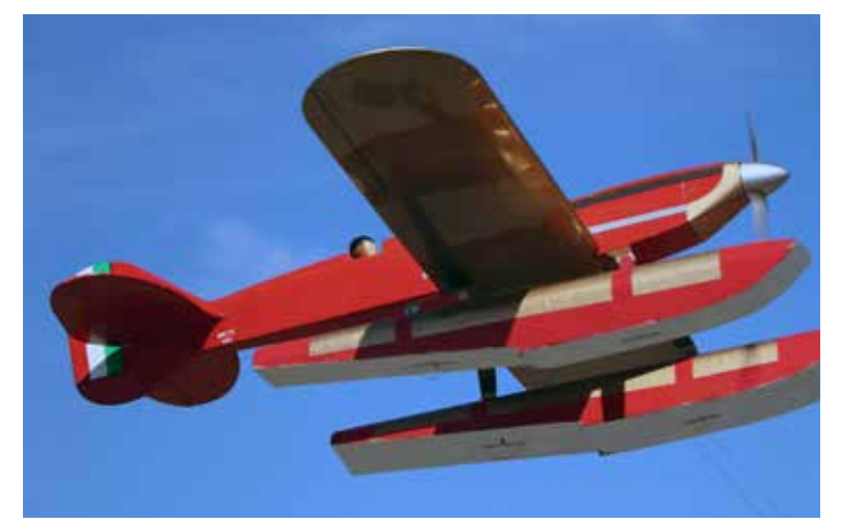
Grant Hiestand's Macchi 72 electric-powered Fun Scale model.