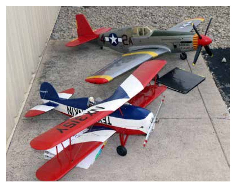
Models waiting to get judged for static points.