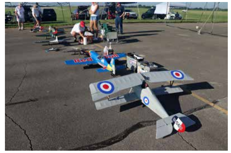
Pit row with the Nieuport 17 in line. The size difference can be seen here.