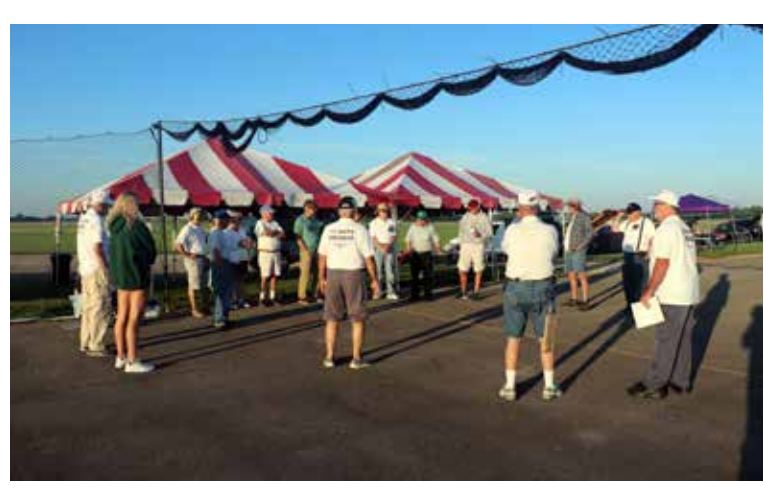
CL Scale pilots meeting at 7 a.m. Saturday.