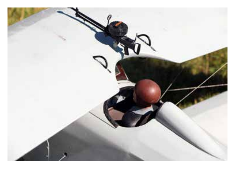
Cockpit of Allen's Nieuport 17.