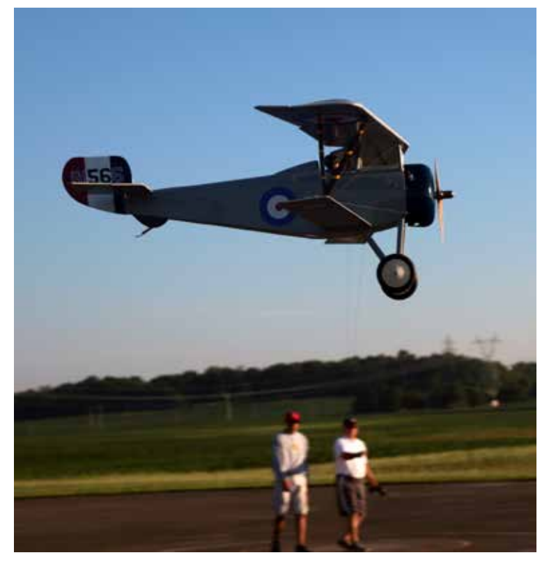
Based upon the early morning light you can tell this is Dawn Patrol at its finest.