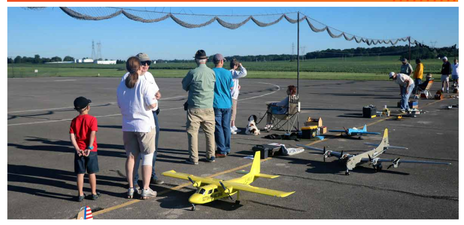
The pit area has all of the models lined up with the flying lines attached, waiting for their turn to fly.