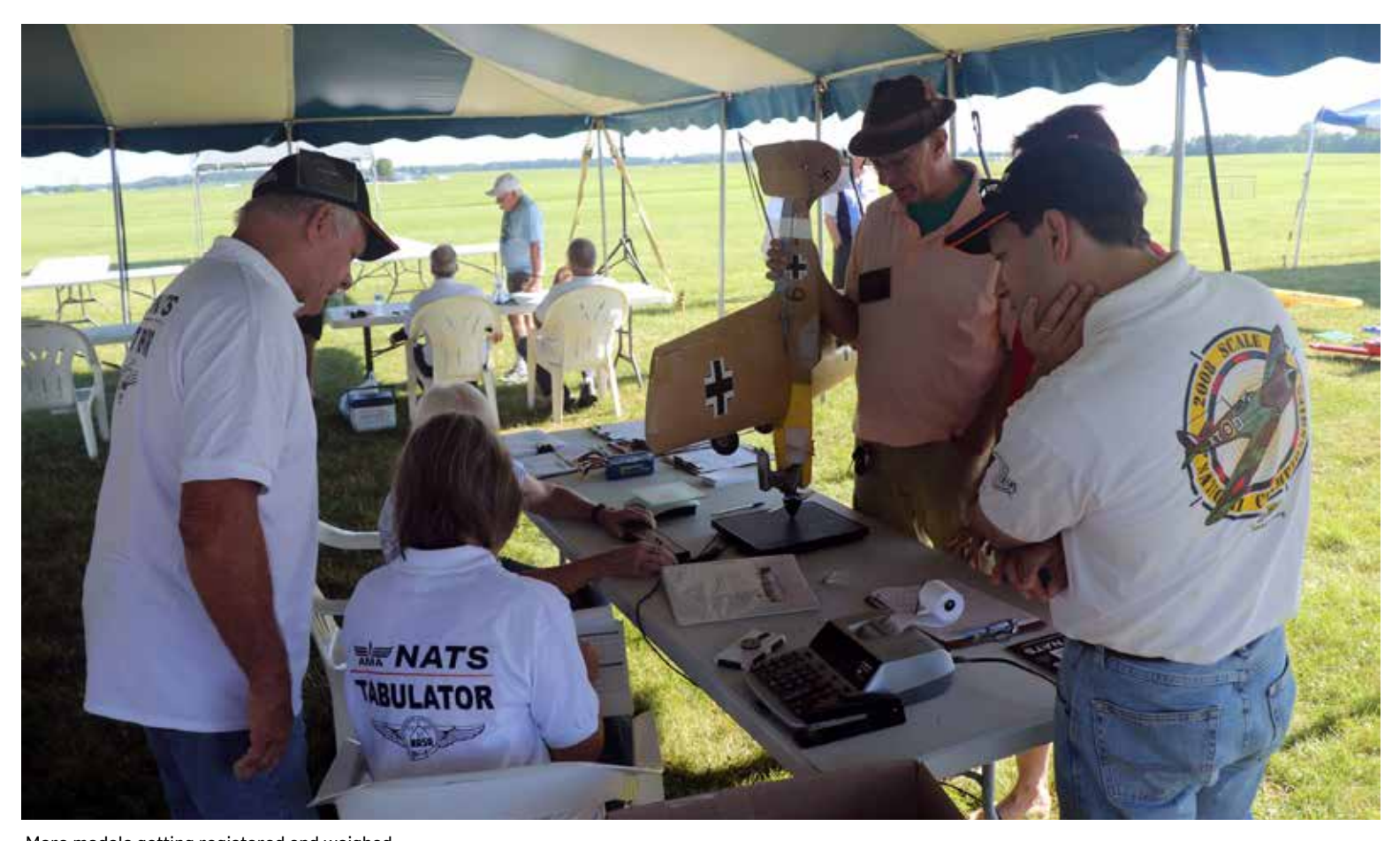
More models getting registered and weighed.