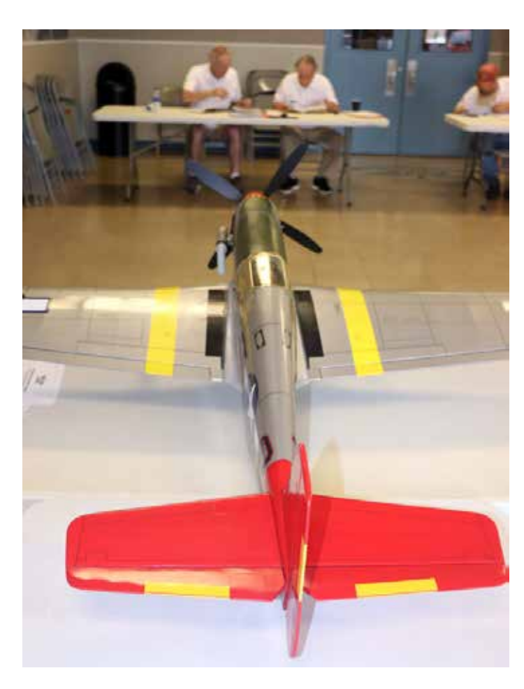
A Fun Scale P-51 being judged for static points from 15 feet away. The judges can't get any closer than this in Sport, Profile, or Team Scale.