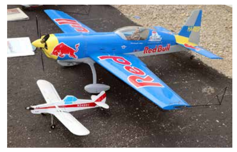
The size difference between the 1/2A-powered models and the larger Sport Scale models can be clearly seen here.