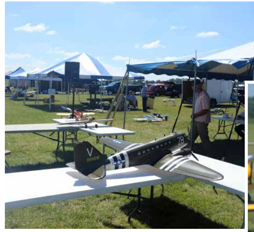
Ed Mason's DC-3 built from the Top Flite RC kit has electric power, flaps and 2.4GHz for the controls during static judging for Authentic Scale.