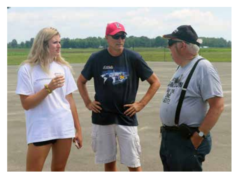
After all of the flying was done, it was time to pack up and visit with everyone.