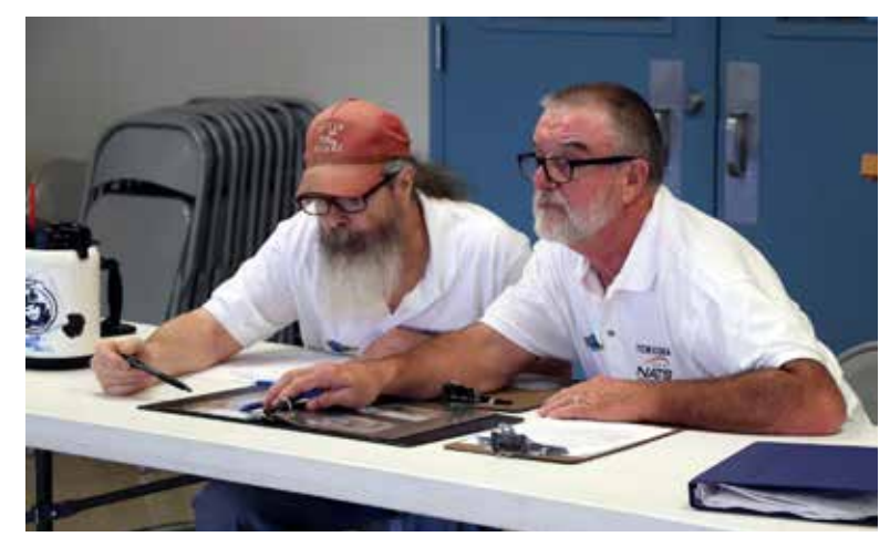
The static judges compare the information presented in a documentation book provided by a pilot and see how well the model matches that information.