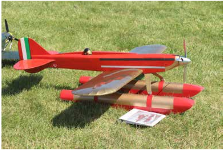
Grant Hiestand's electric-powered Macchi racer for Fun Scale has wheels built into the floats to fly off the concrete.