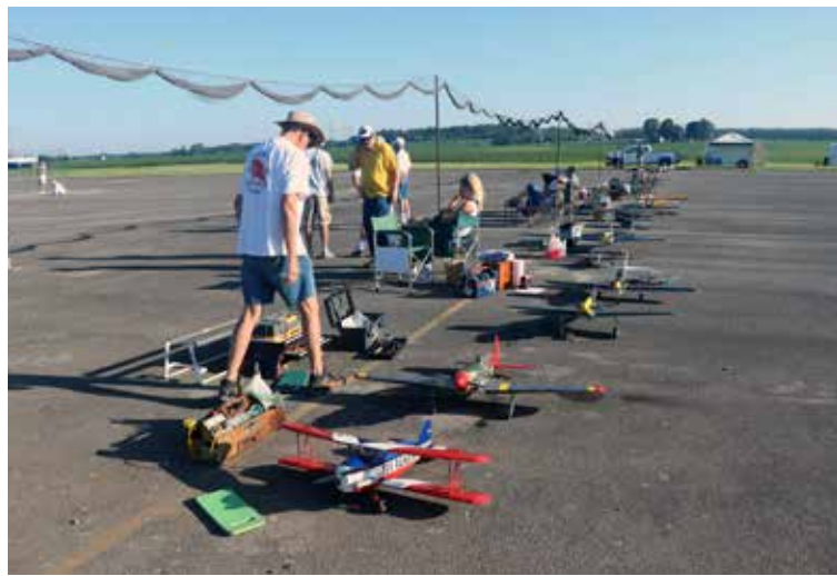
The pit area filled up some more before 8 a.m. and the temperature started to warm up.