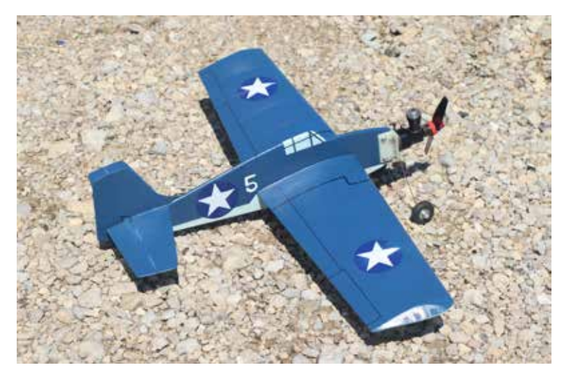
{\it Christopher\ DeGroff's\ Wildcat\ for\ 1/2A\ scale}.