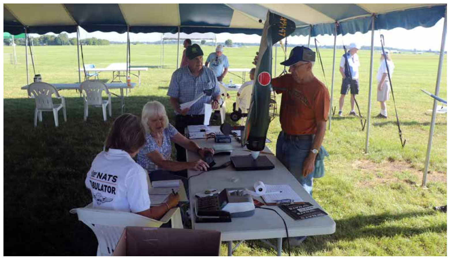
Registration included weighing the models and getting the information on the type of aircraft flown.