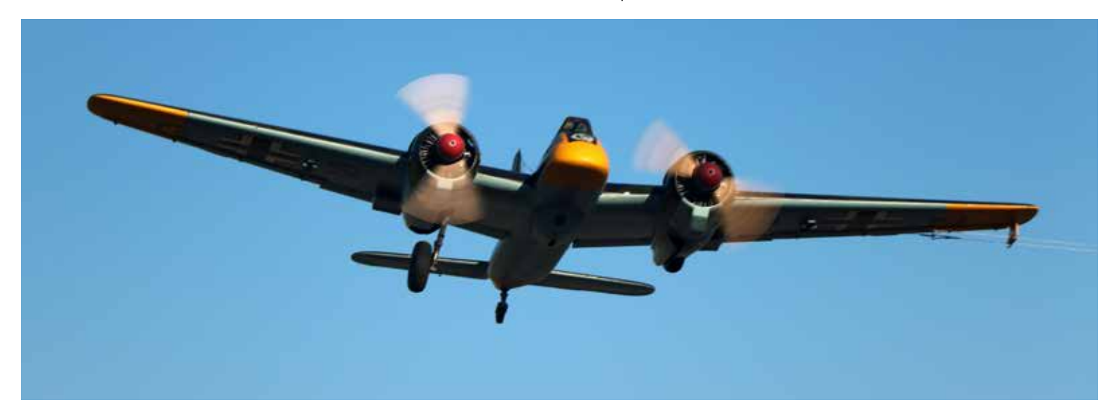
The Henshel 127 has retracts, flaps, and a bomb drop.