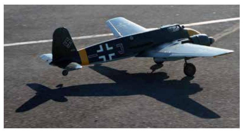
Take off run for the Henshel 127.