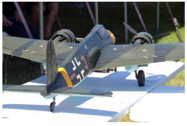
Chuck Snyder's Henschel. Look for this model in Authentic Scale in the west circle.