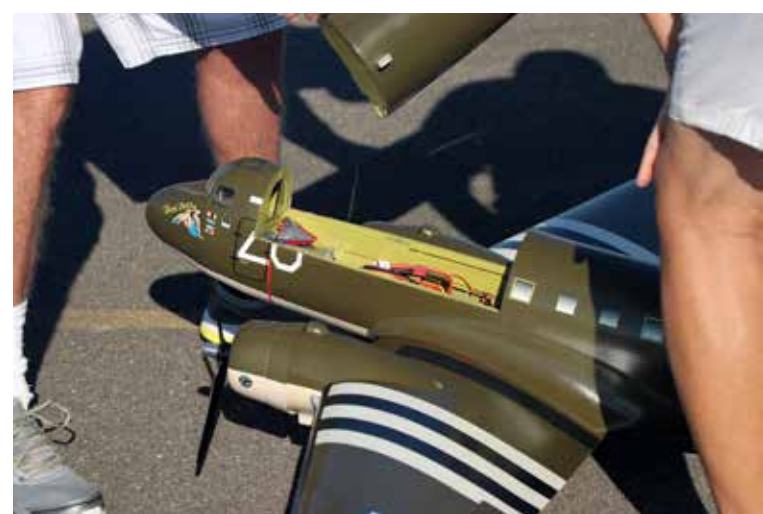
The forward section of the DC-3 fuselage comes off to allow for the batteries to be installed and service the model.