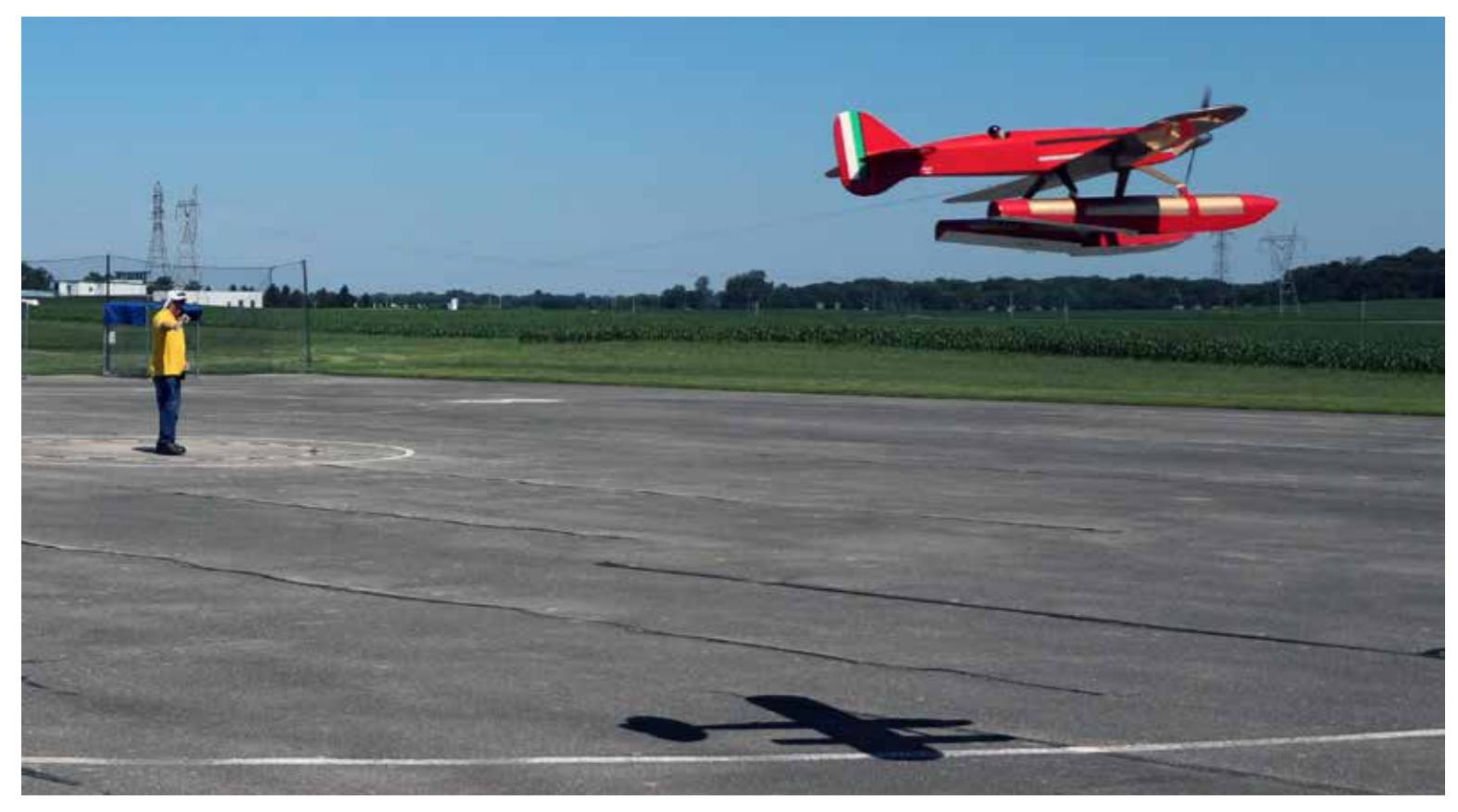
Grant Hiestand's Macchi 72 electric-powered Fun Scale model.