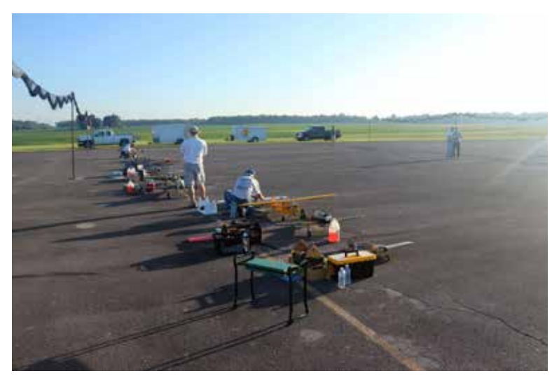
The pit area at 7 a.m. while everyone setup to get in their first flights.