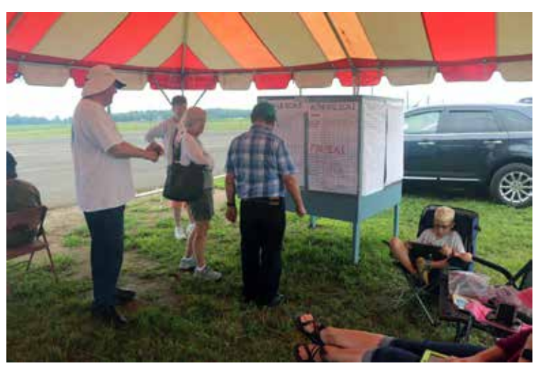
Checking out the final results after all of the flying was completed.