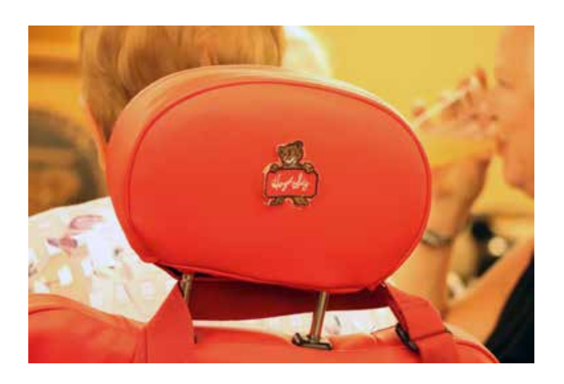
The patch on the headrest of Hazel Sig's wheelchair makes it very clear who she is.