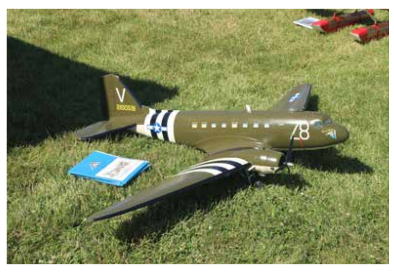
Overall shot of Ed's DC-3. The full scale is near his home in Florida.