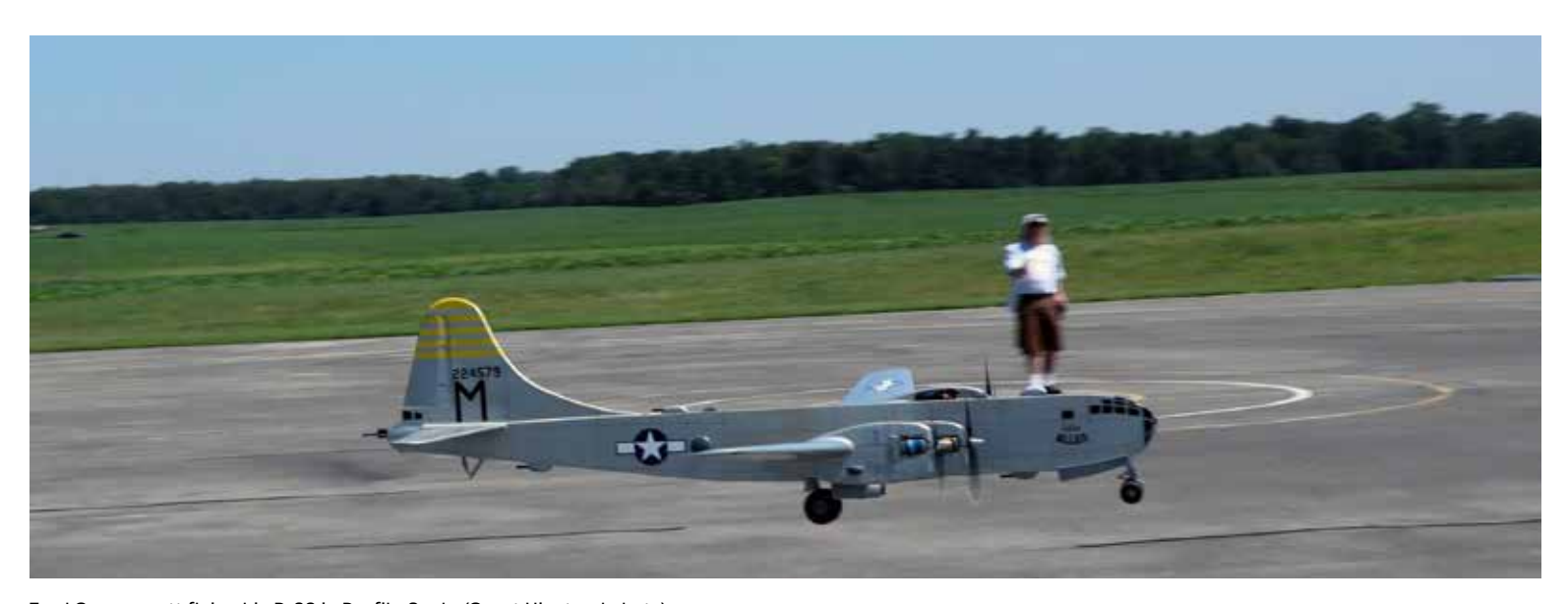
Fred Cronenwett flying his B-29 in Profile Scale.