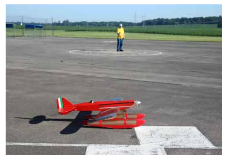
Grant Hiestand's Macchi 72 is not floating. The wheels in the floats are just high enough to allow the model to roll, take off, and land.