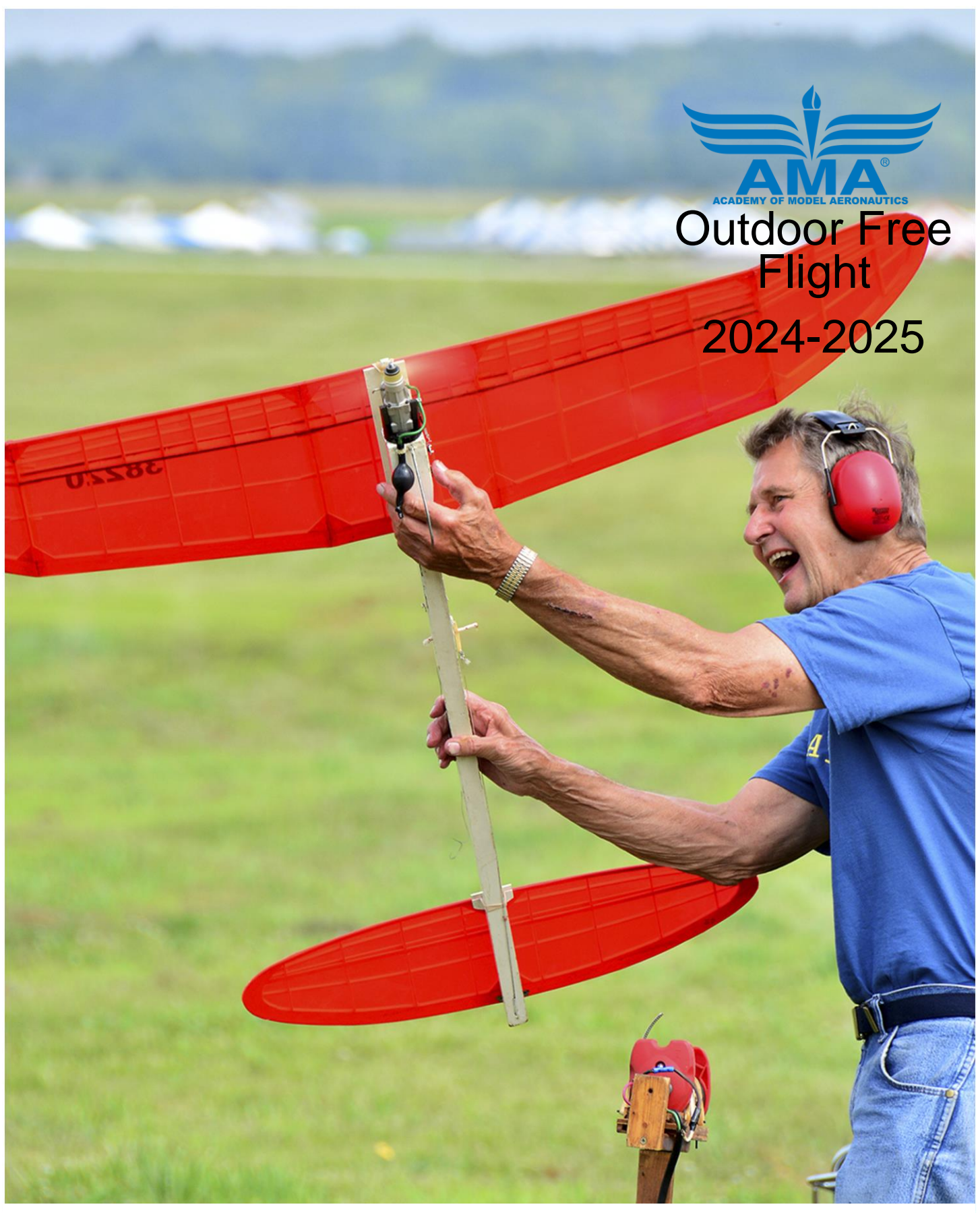
RULES GOVERNING MODEL AVIATION COMPETITION IN THE UNITED STATES