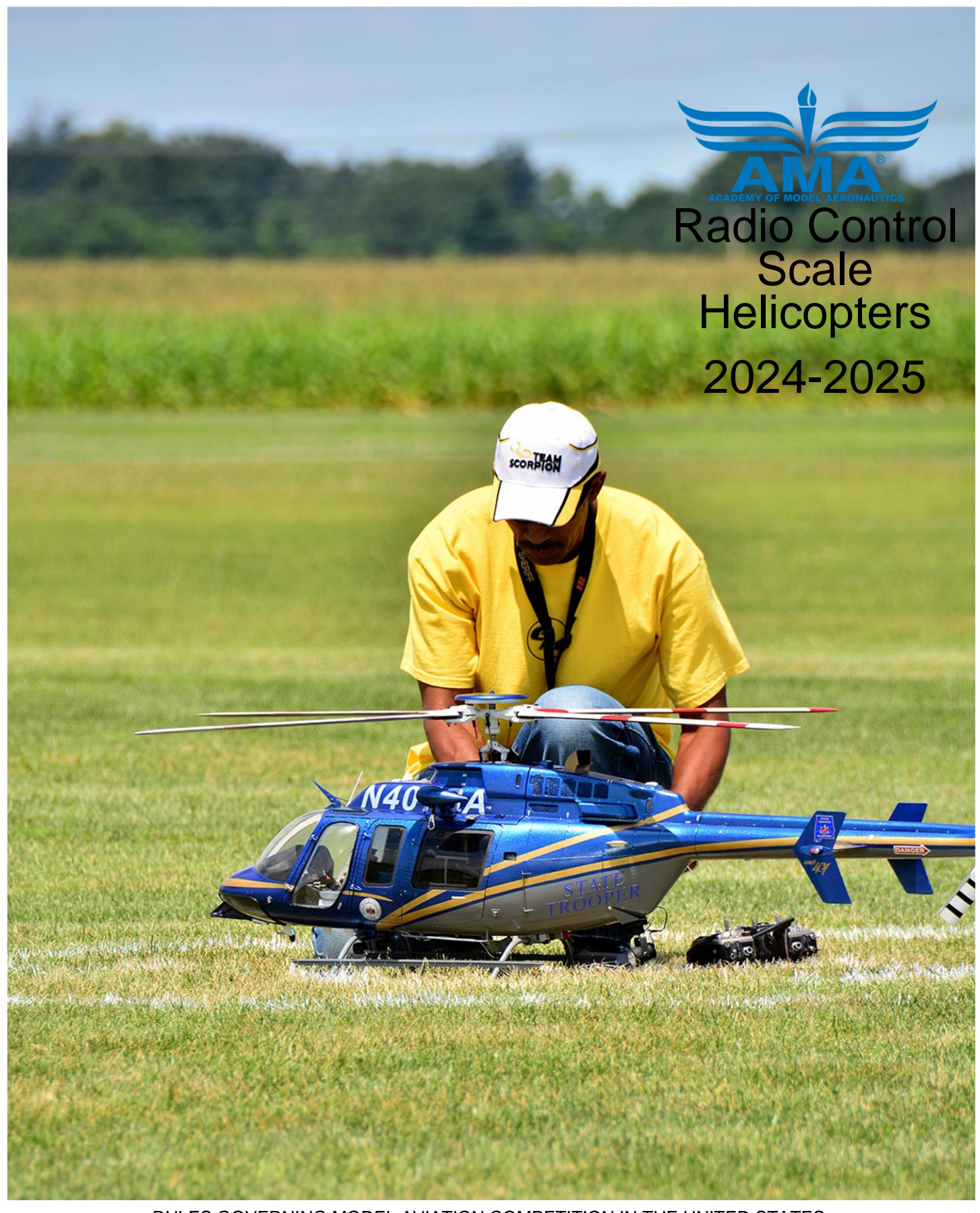
RULES GOVERNING MODEL AVIATION COMPETITION IN THE UNITED STATES