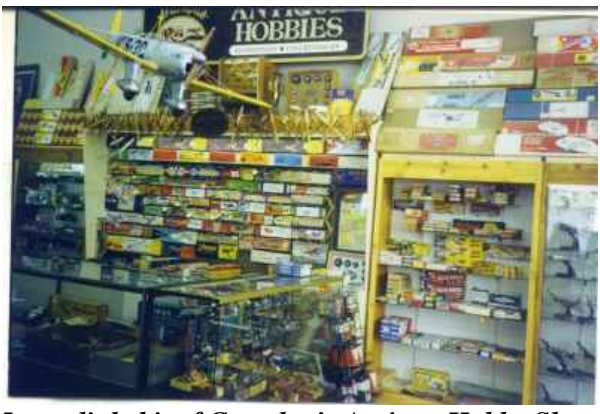
Just a little bit of Grandpa's Antique Hobby Shop.