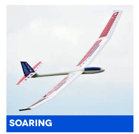
Glide silently through the sky using only the wind.