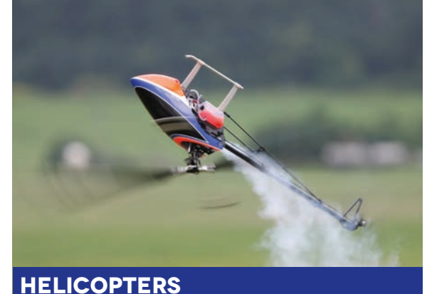
Pilot a gentle scale helicopter, or an aerobatic fun machine.

Visit www.amaflightschool.org/get-started to see the excitement of aeromodeling in a short video produced by the Academy of Model Aeronautics!