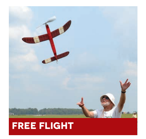
Carefully engineer your plane to stay aloft on its own.