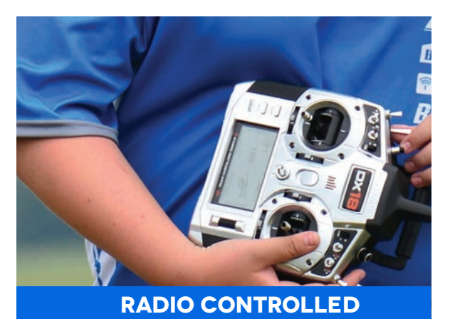
Control every aspect of your flight with a radio transmitter.