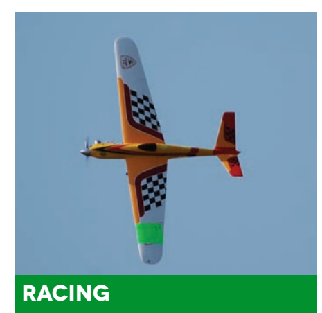
Earn a win by pushing your machine and your mettle.