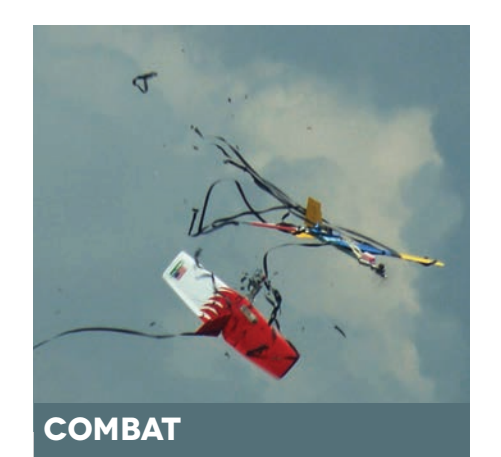
Earn your stripes and test your skill in airborne dogfights.